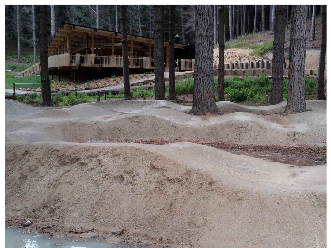
DIRT PUMP TRACK