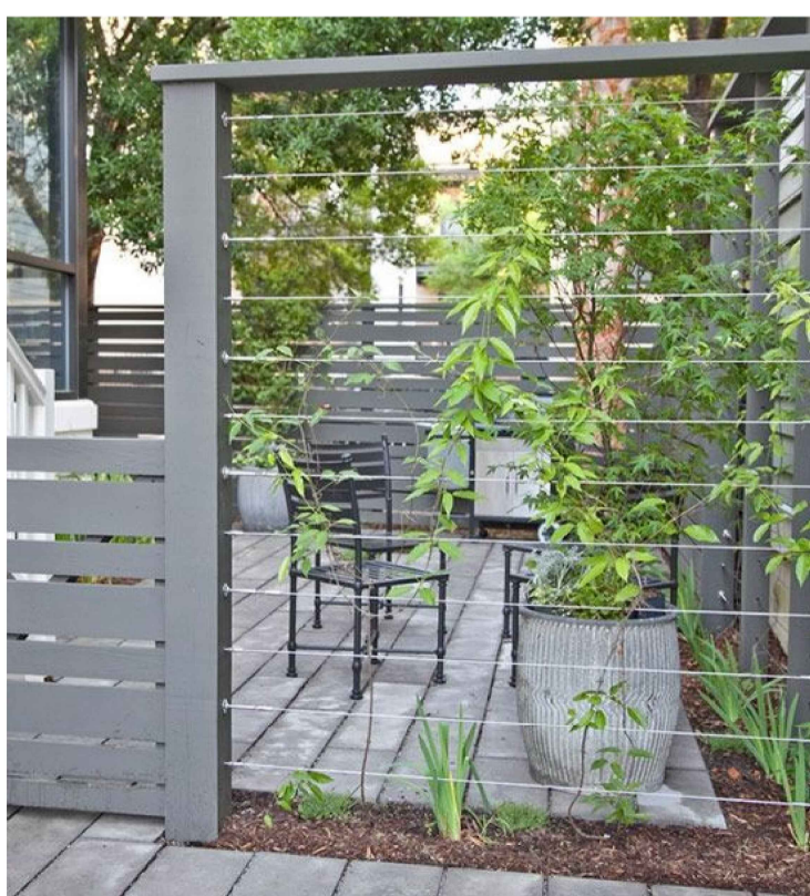
PLANTING SCREEN x 7