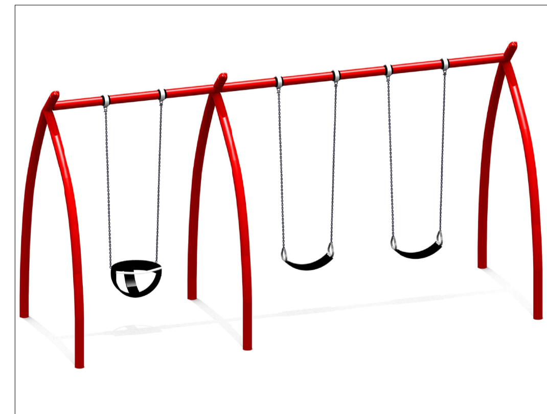
1.5 BAY SWING WITH TWO STANDARD SWINGS AND ONE INFANT SWING