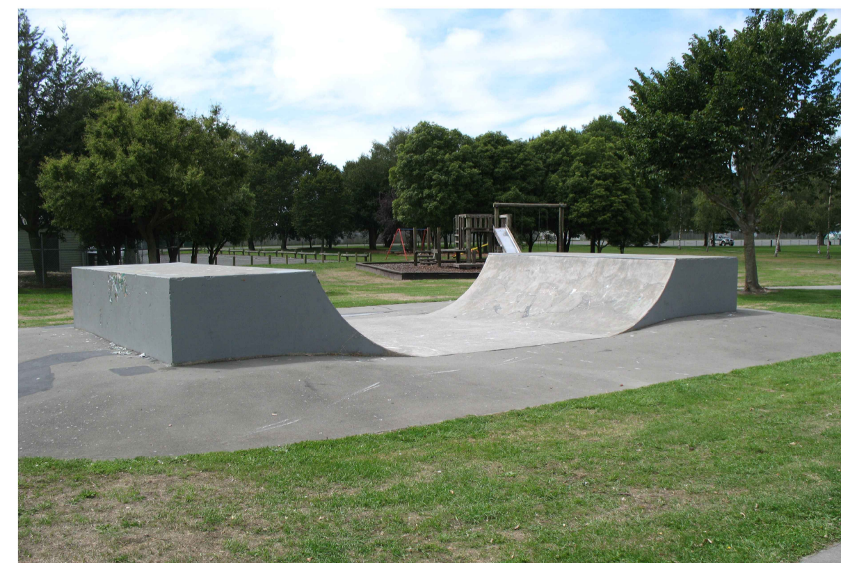
CONCRETE HALF PIPE (to be embedded into the slope)