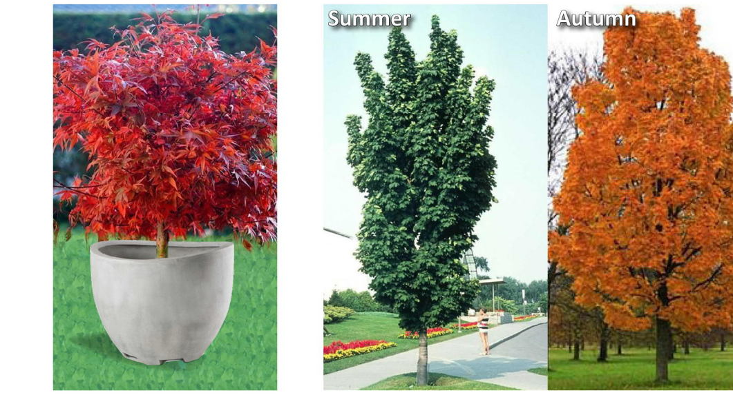
Acer palmatum (Japanese maple) Proposed for east side of Victoria Street