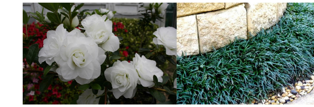
Azalea brides bouquet (dwarf white flowering azalea)