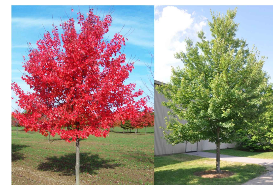
Red Maple ( Acer rubrum 'October Glory')