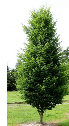
Columnar Hornbeam ( Carpinus betulus 'fastigiata')