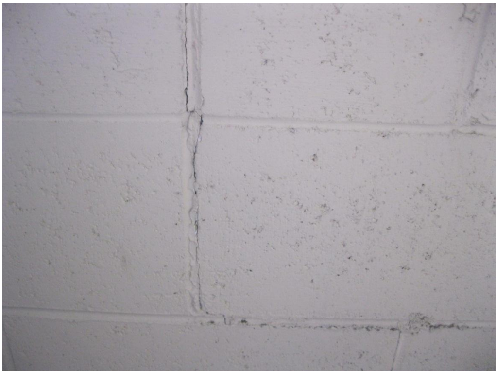
Photograph 6: Cracks along blockwork mortar lines