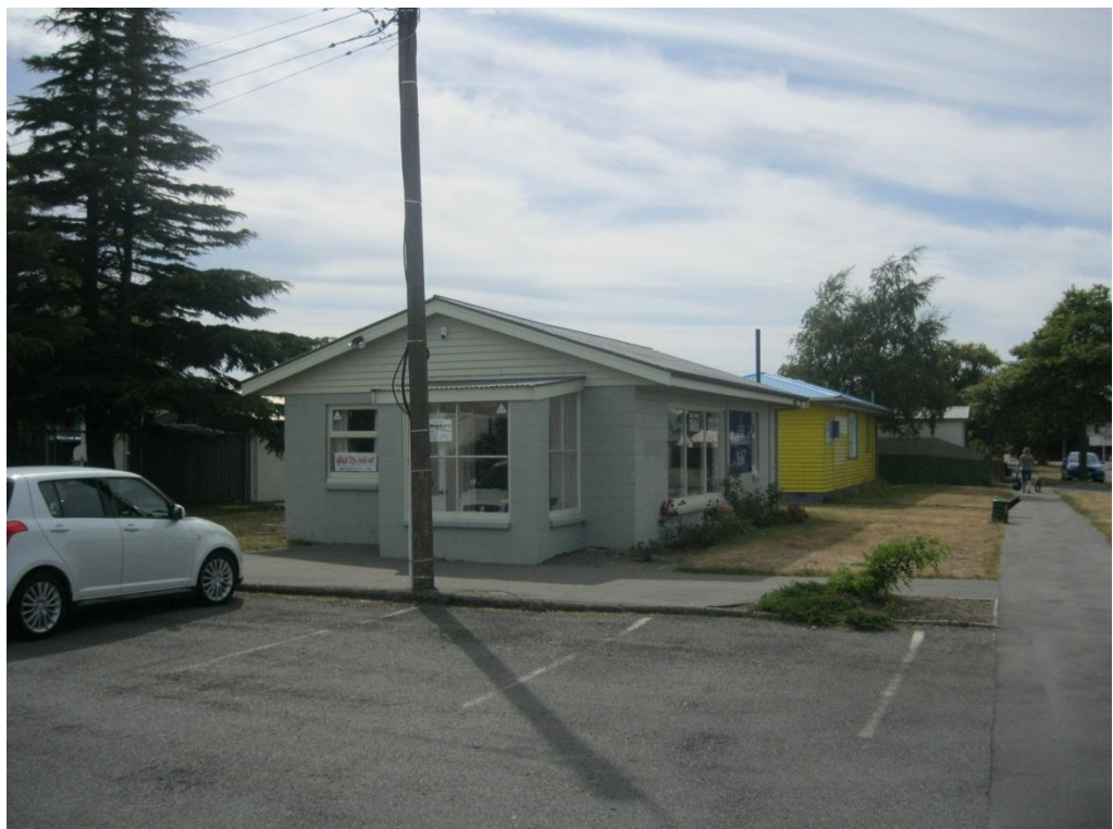
Photograph 2: West Elevation