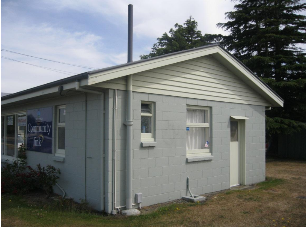
Photograph 4: East Elevation