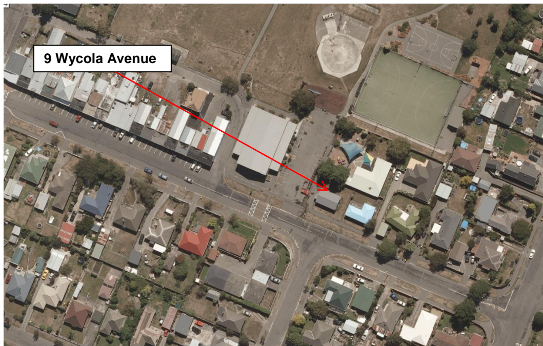
Figure 3 Post February 2011 Earthquake Aerial Photography 2

Aerial photography taken following the 22 February 2011 earthquake (below) shows no signs of liquefaction outside the building footprint or adjacent to the site.