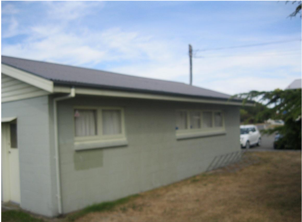
Photograph 3: North Elevation