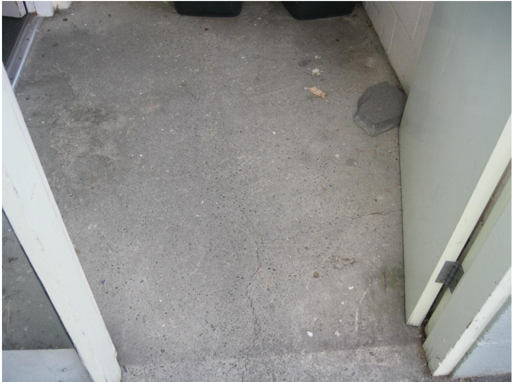
Photograph 5: Concrete slab on grade cracking