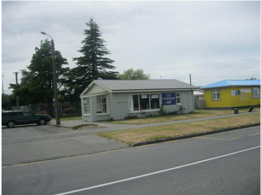
Photograph 1: South Elevation