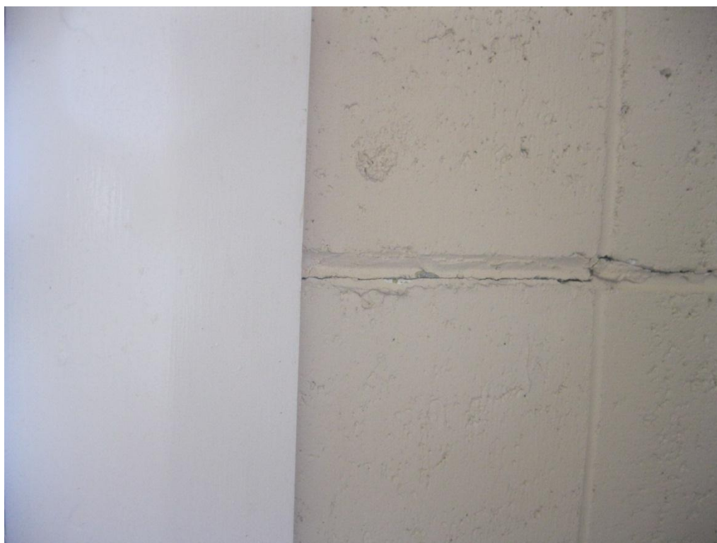
Photograph 7: Cracking along blockwork mortar lines