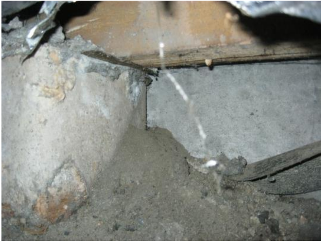
Photograph 7 Timber bearer supported by concrete pile.