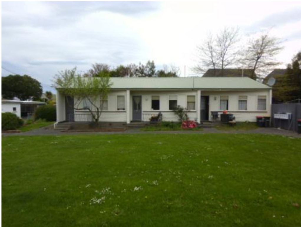
Photograph 1 Front elevation.