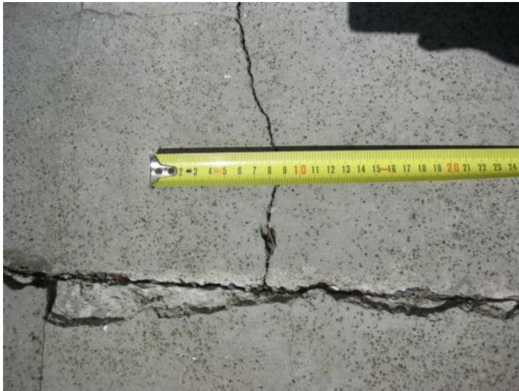
Photograph 5 Cracking to external paving.