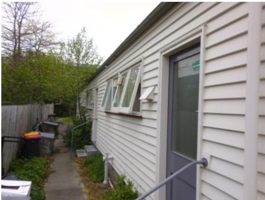
Photograph 2 Rear elevation.