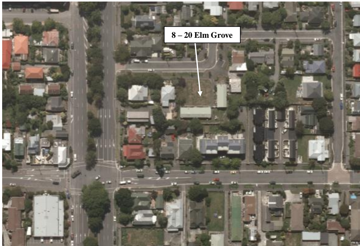
Figure 3 Post February 2011 Earthquake Aerial Photography

The Canterbury Geotechnical database shows there are cracks less than 10mm within 100m of the site 6 .