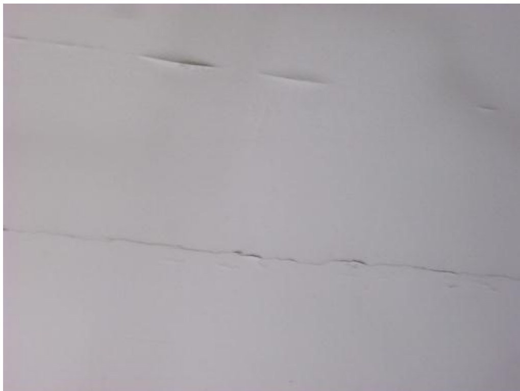
Photograph 6 Cracking to plasterboard linings.