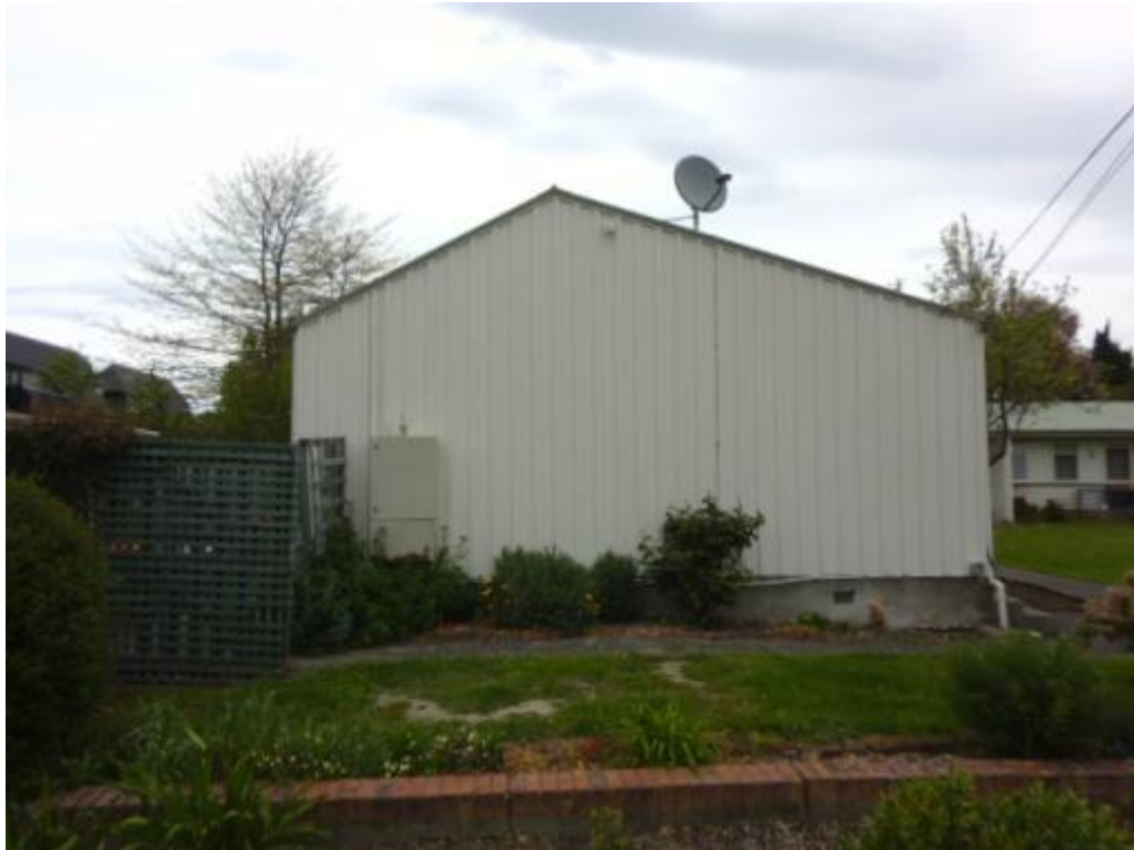
Photograph 3 Side walls with lightweight cladding.