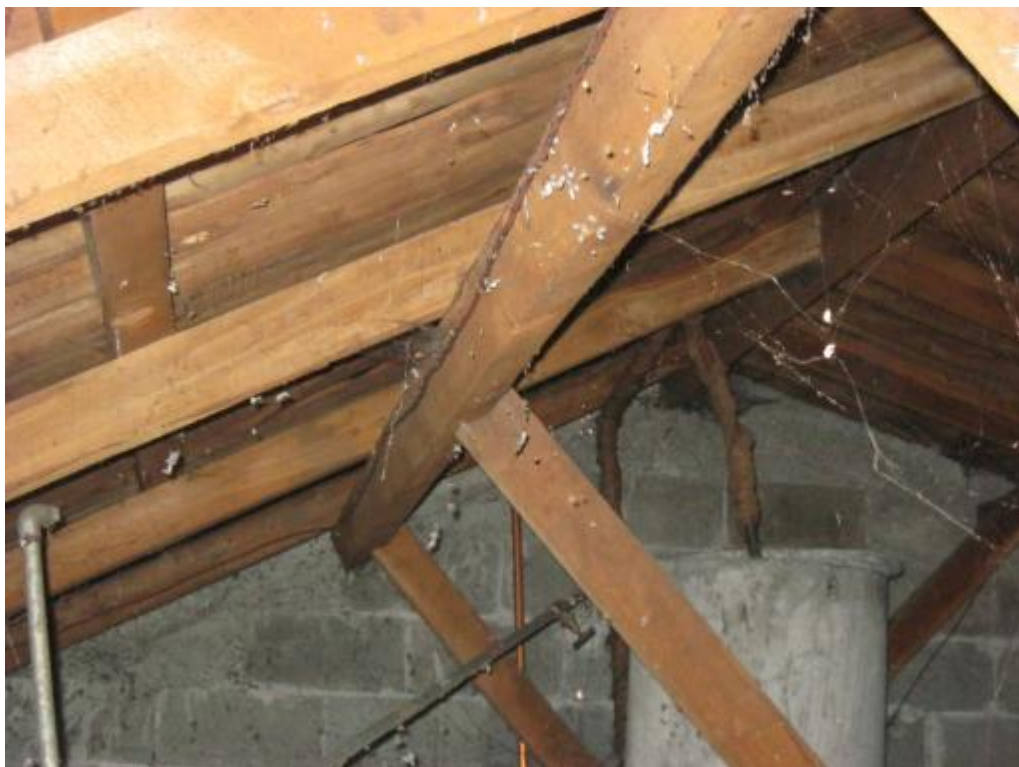
Photograph 4 Roof structure.