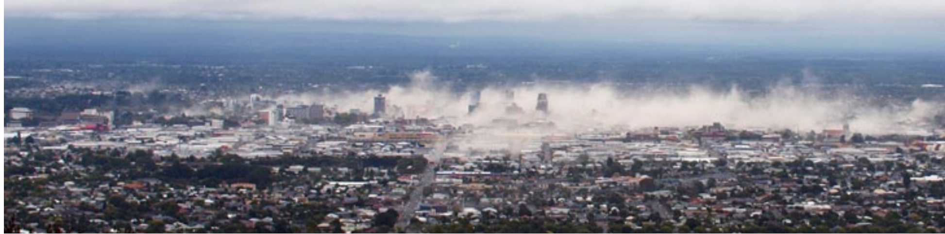
Above: Moments after a 6.3 Magnitude earthquake hits Christchurch on 22 February, 2011.