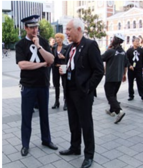
White Ribbon Day 2010