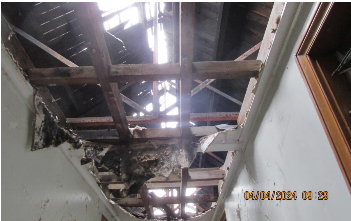
South-East End Roof Structure (fire damage accommodation block)