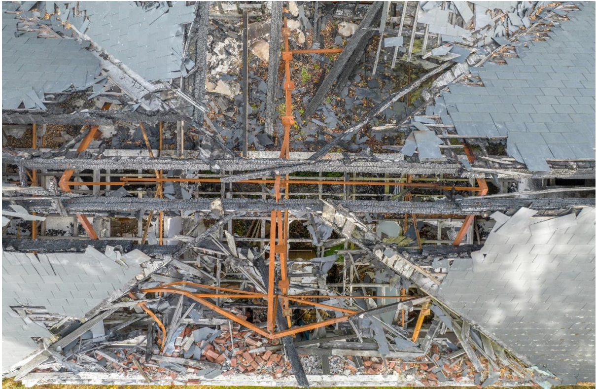
South-East End Centre Roof Structure (fire damaged accommodation block)