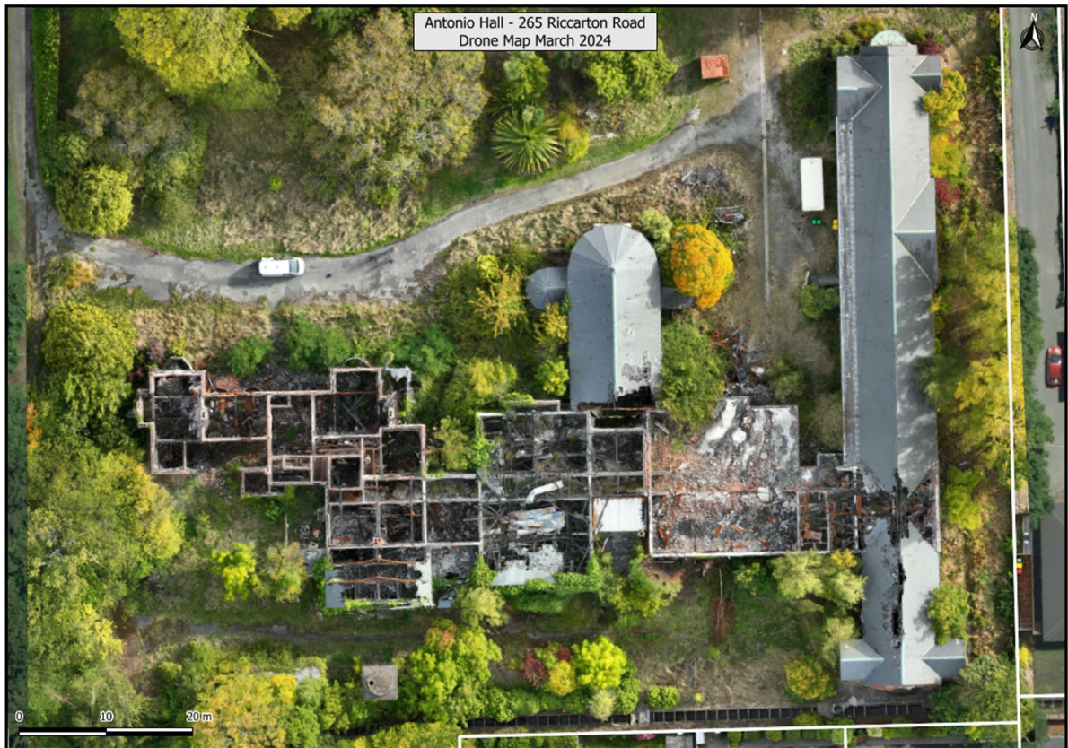
Aerial Drone Photo of the Entire Site.