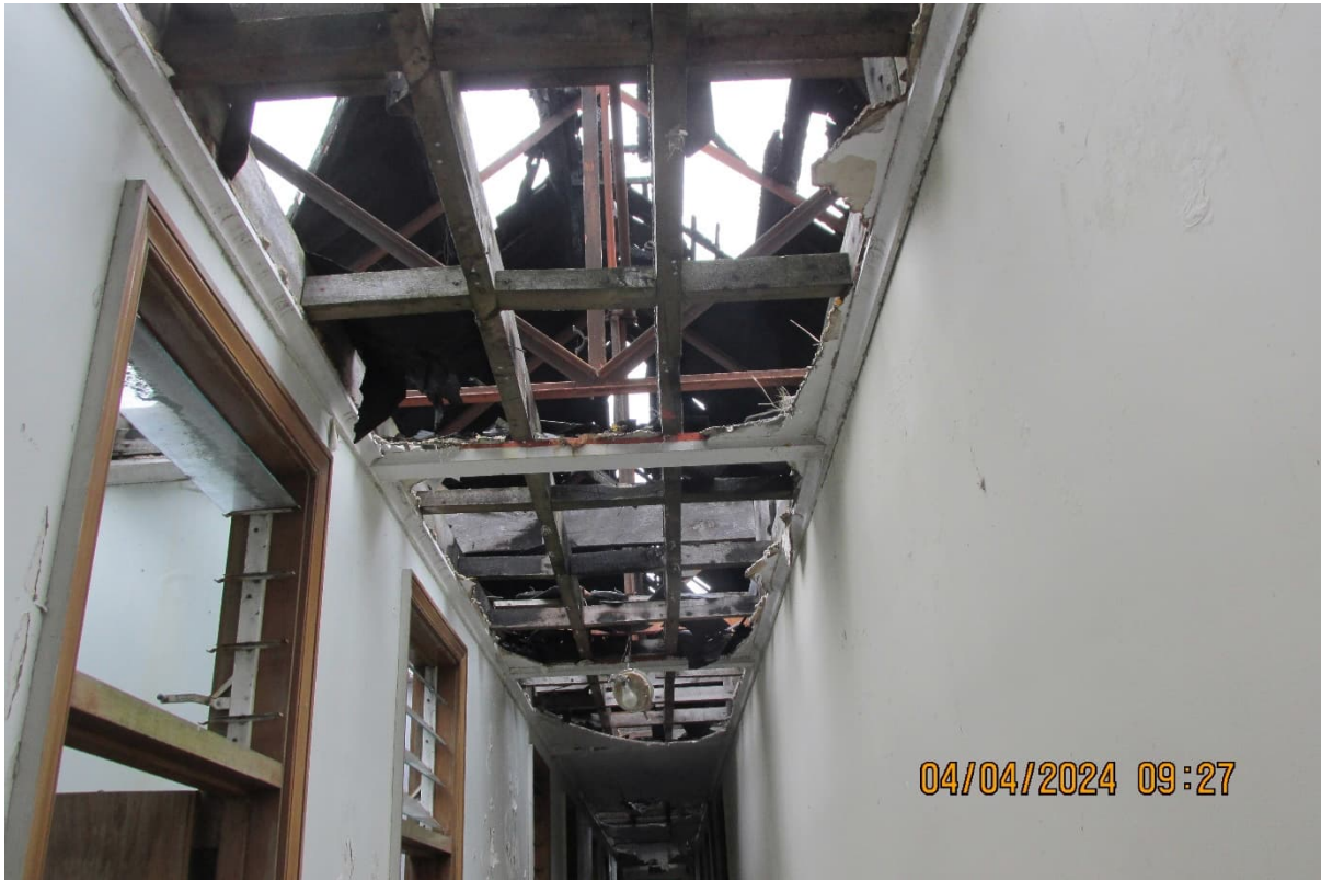
South-East End Roof Structure (fire damage accommodation block)