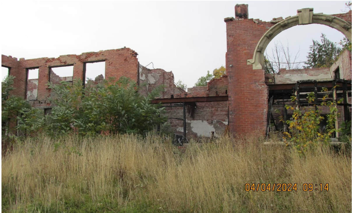
North-West End Building Structure (main homestead)