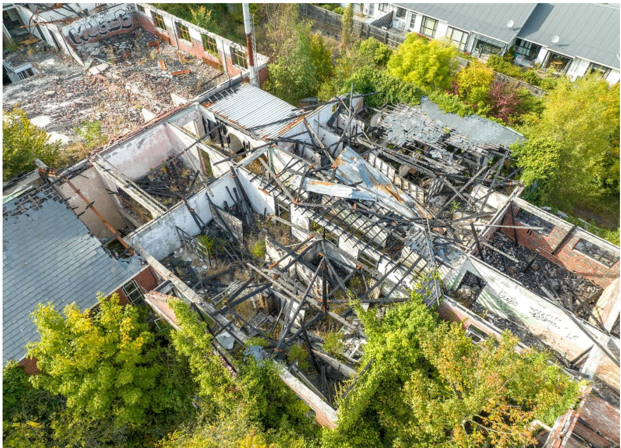
Centre South-East End Roof Structure (unsuitable debris)