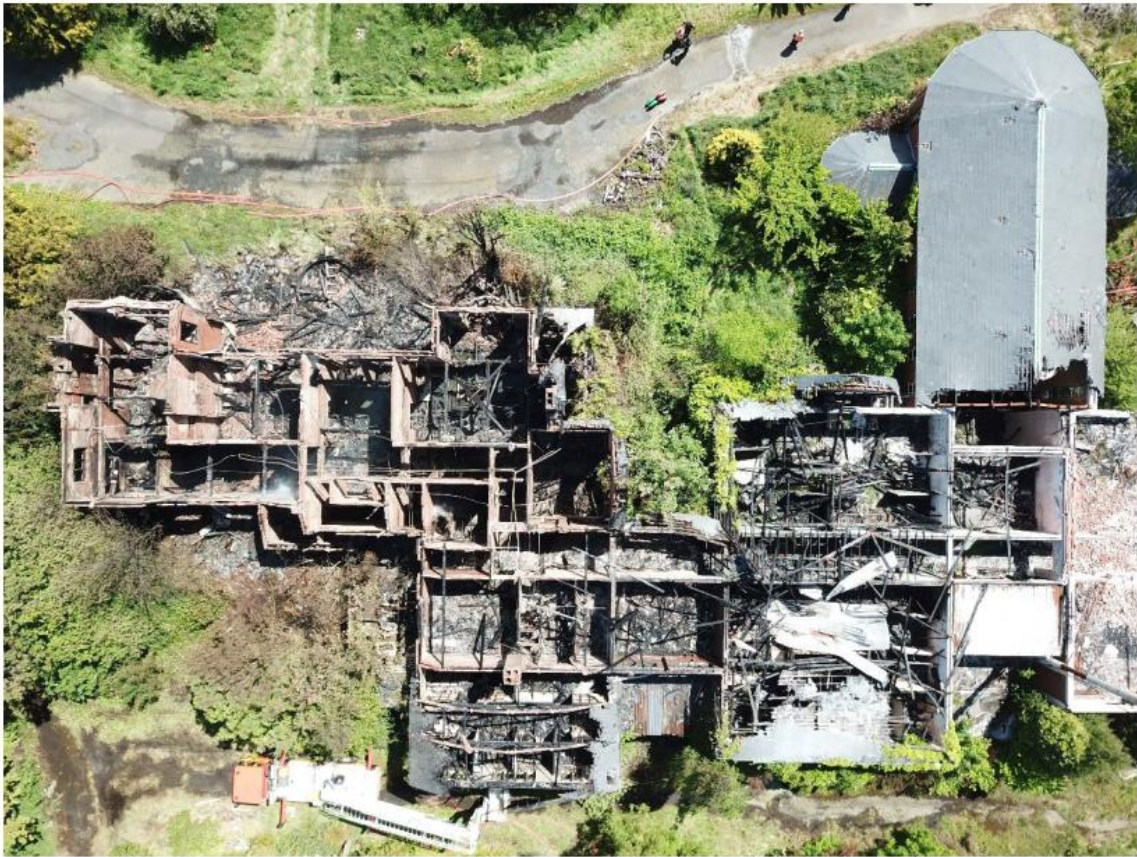
Aerial photograph showing extent of fire damage to original homestead