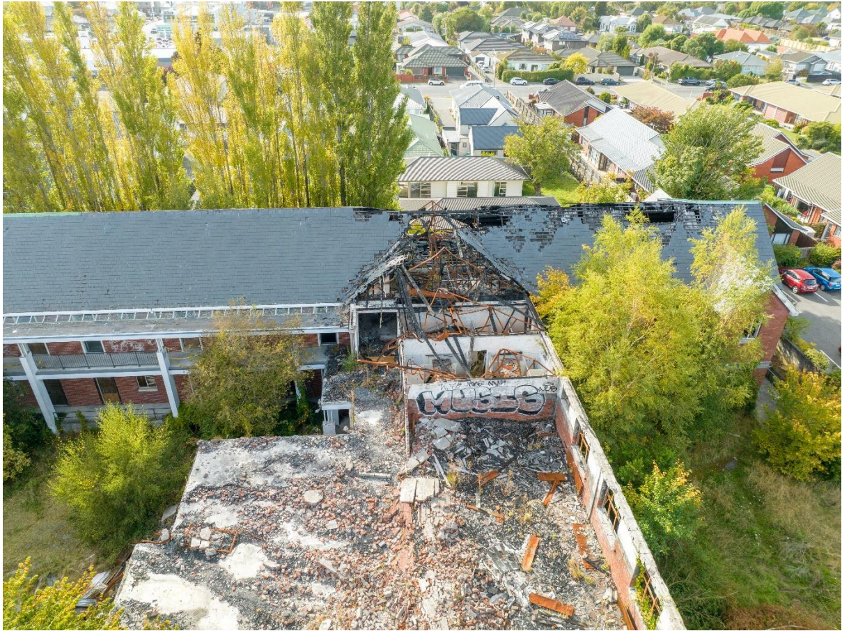
Fire damage to accommodation wing roof and gable ends. CCC drone footage, March 2024.