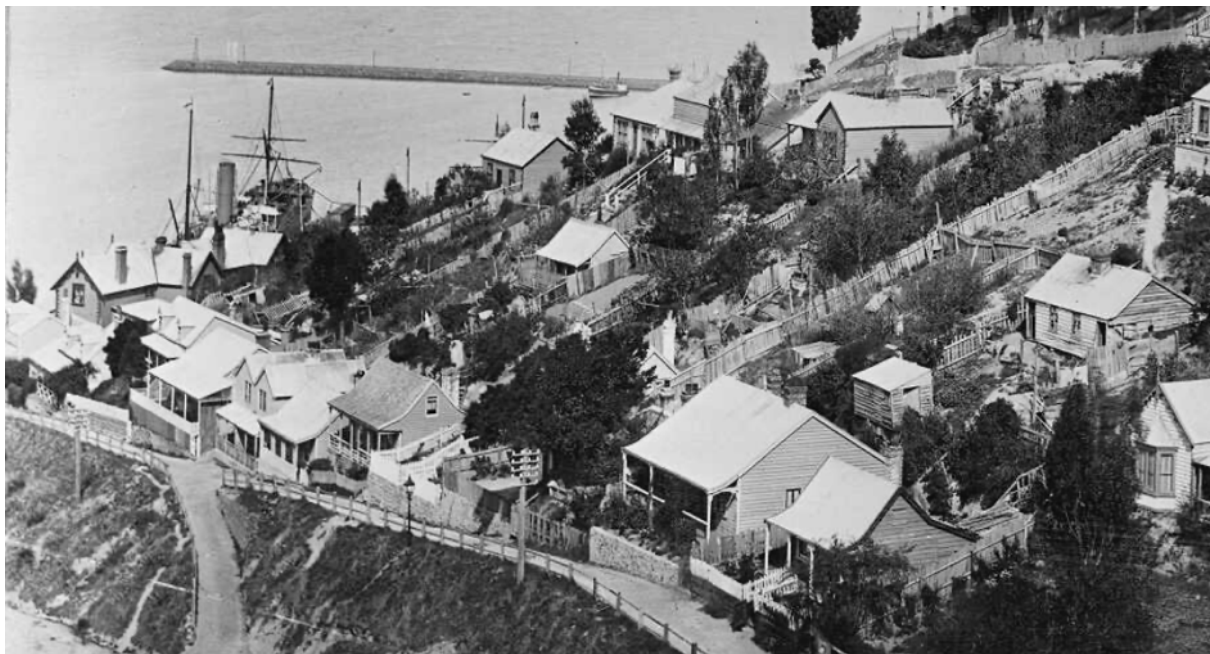
Hawkhurst and Ticehurst Roads in the 1870s.