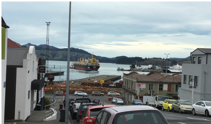
View south from Canterbury Street.