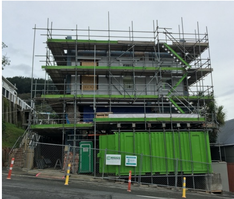
Former Kilwinning Lodge, Canterbury Street, under repair.