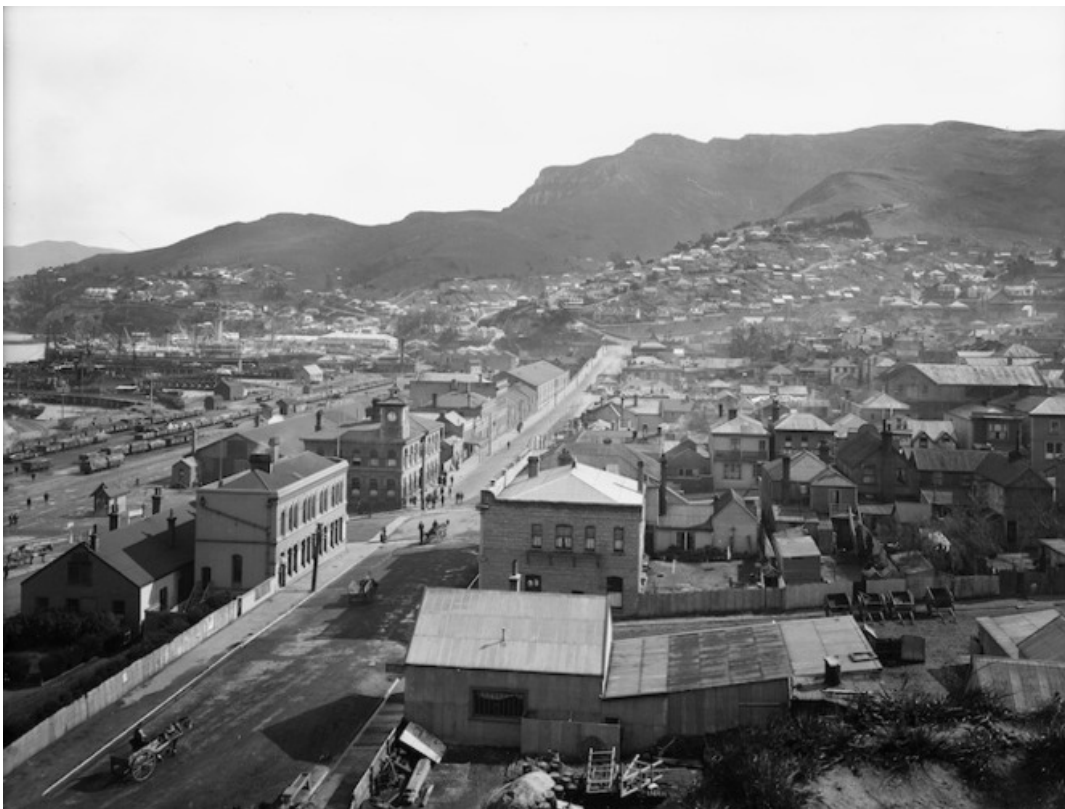
A view of Lyttelton, looking west along Norwich Quay, in c.1912. 1/1-008556-G, Alexander Turnbull Library, Wellington.

With the arrival of the 'First Four Ships' in late 1850, the official British settlement of Canterbury had begun. Lyttelton, which was briefly known as Port Cooper and then Port Victoria, welcomed the new immigrants, most of whom soon moved on to Christchurch or elsewhere on Banks Peninsula. Before the rail tunnel was built by the provincial government in the mid-1860s, people and goods were either shipped round to Sumner or moved by packhorse over the Bridge Path. As thousands of new arrivals passed through the port town, Lyttelton's resident population grew to a peak of just under 4,500 in 1915; in the century since its population has fallen to just over 3,000.