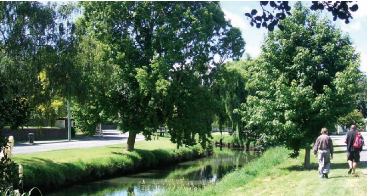
The Heathcote River/Ōpawaho as a focus for community recreation.