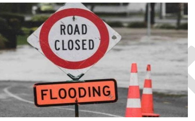
Previous flooding around the Ōpāwaho Heathcote River

✓ We operate 12.1 kilometres of stop bank