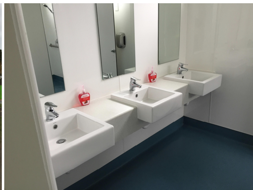
New toilets in the Lodge