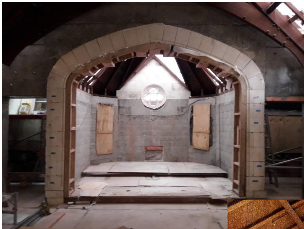
Internal work being carried out

The work to the Chapel has now been completed and the main contractor has been awarded Practical Completion. We have undertaken a remedial inspection and listed all items that are to be completed by the end of September. This includes work to the exterior of the building and the garden areas. The built-in furniture which has been restored is being installed in the third week of September - furniture is currently being stored at Wigram.