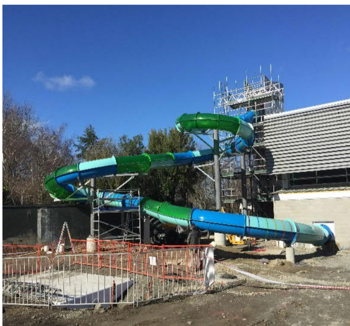
Newly installed Indoor Hydroslide

Stage 3: Work is progressing on Separable Portion 1 “Outdoor Pools and Plant Rooms” that includes pool water services piping works, connections to the existing balance tank, pouring concrete for the chases cut at the bottom of outdoor and dive pools, concrete for the scum/roll out channels, builders work for plant rooms, earth work/piping works for the splash pad, refurbishing works for the outdoor hydroslide pool and cracks injection of foundation beams/columns. Separable Portion 2 “Reception foyer/Café and Chang Rooms” is planned to start by the end of November 2018.