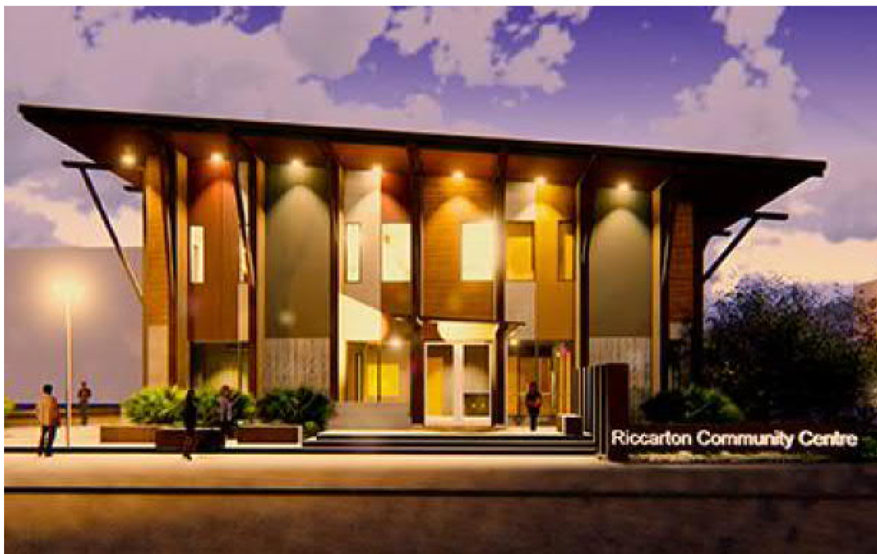
Artists Impression of Clarence Street view of Riccarton Community Centre

A 3D walkthrough of the design model was made available for viewing by some stakeholders in the latter part of the Detailed Design process and was well received. Construction is expected to commence late 2018 and the project is on track for an opening by Christmas 2019.