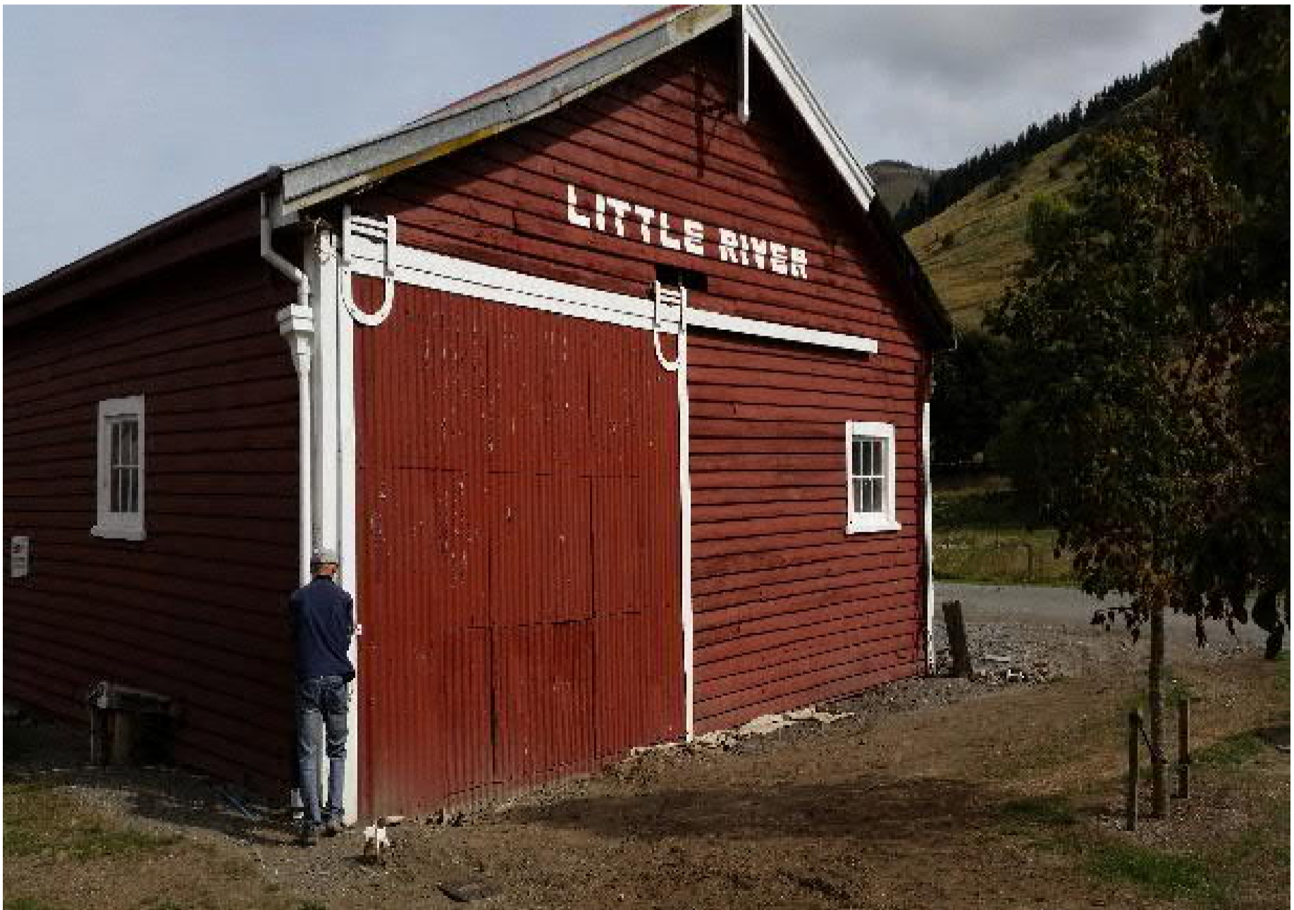
Little River Goods Shed

The Council Long Term Plan (LTP) recently released this project to proceed. Investigations are underway. Scope and drawings being compiled. Next stage is to obtain building consent and engage the builder.