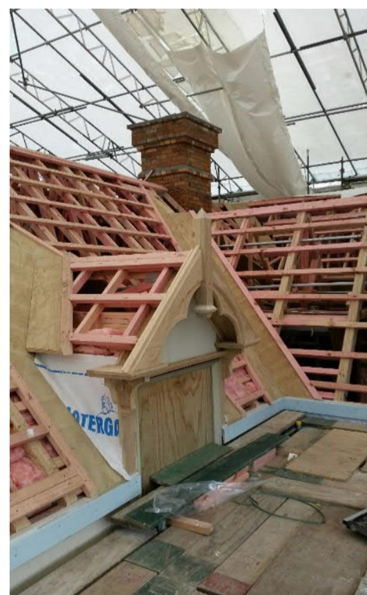
Restoration work on the roof and chimney