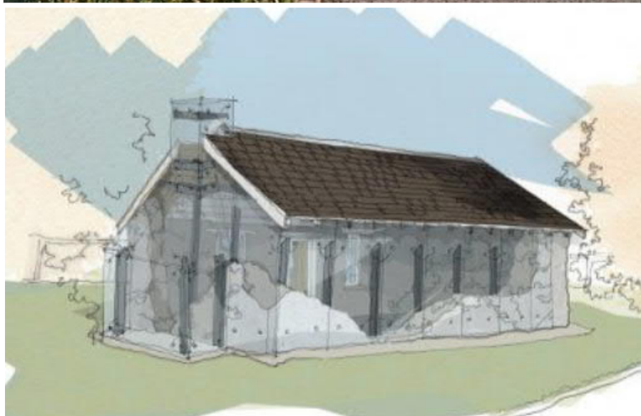
Option 1 Glass Interpretation