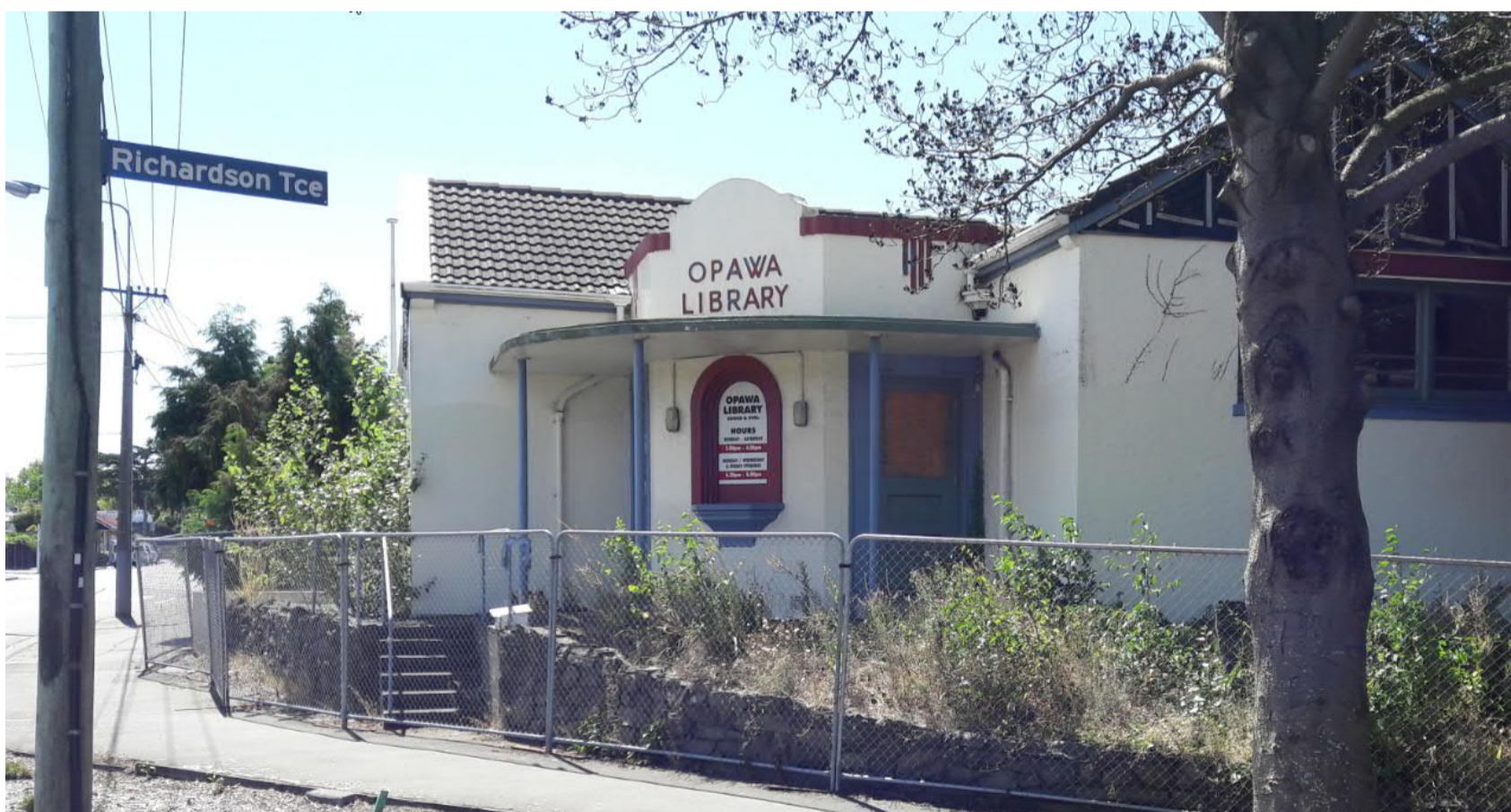
Existing front entrance

The Project Manager is preparing a Request for Tender for the demolition works by means of a Closed Tender process via GETS. This demolition contract will only be signed after the construction contract for the new building is agreed.