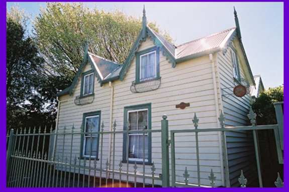
Heritage Cottage Holly Road