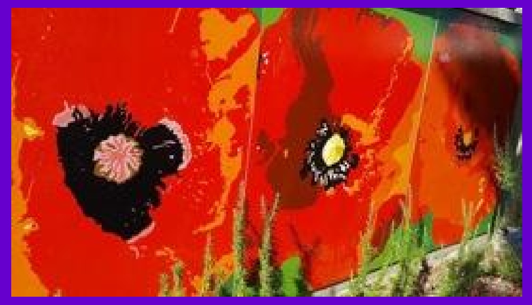
Papanui Memorial Mural