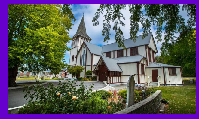
St Pauls Papanui