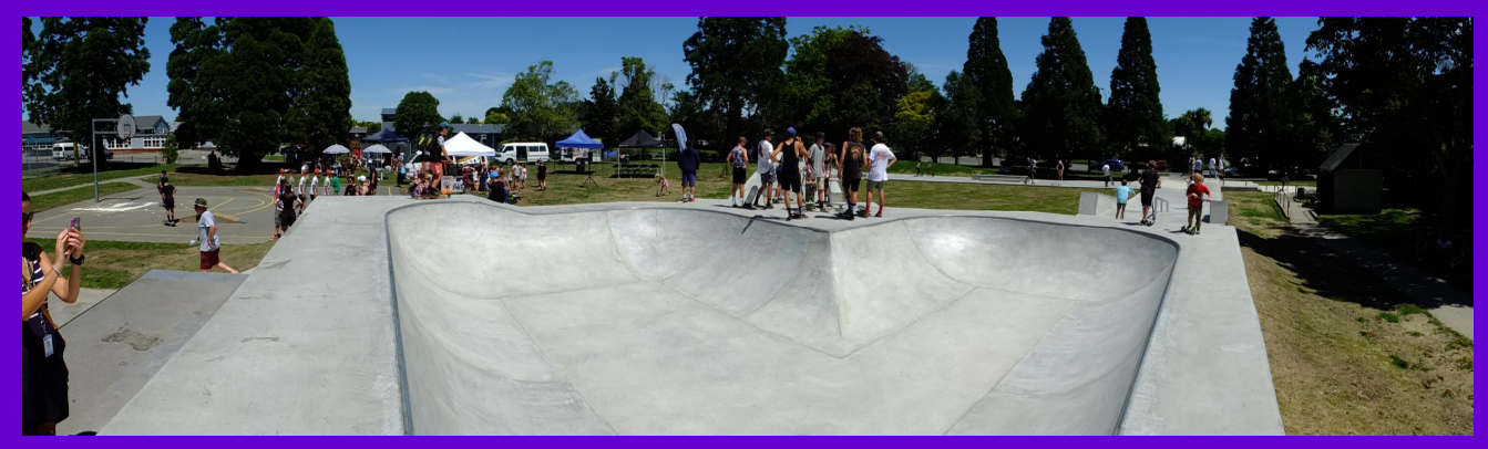
Sheldon Skate Park