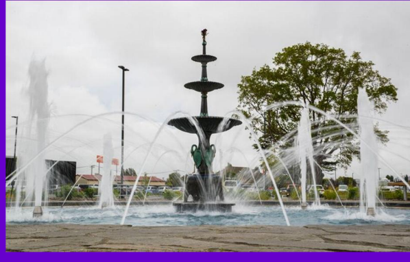
Sanitarium Fountain Harewood