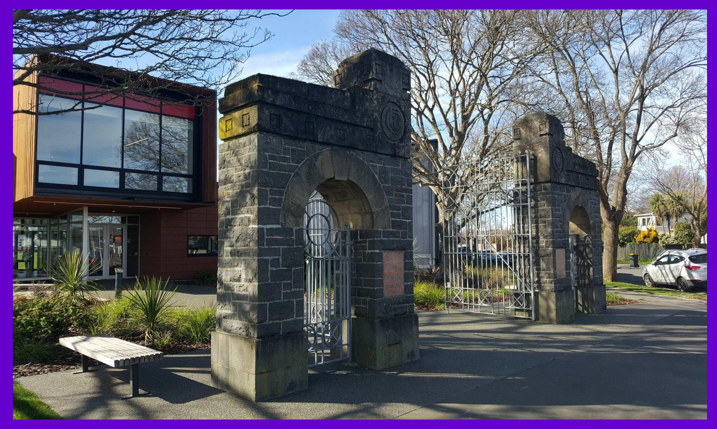
Rugby Park - Home of the Crusaders