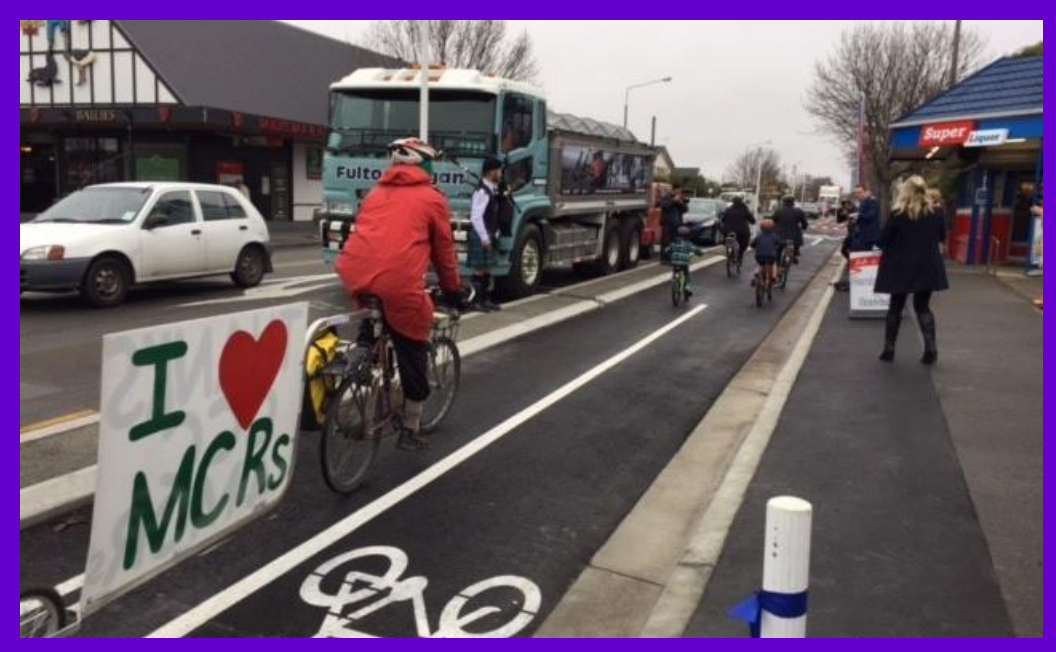
Papanui Parallel Cycleway