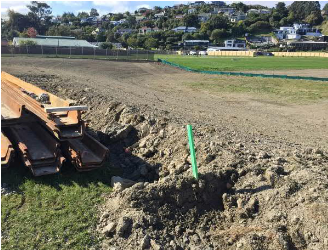
Completed earthworks adjacent to Cashmere Valley Drain

Reducing the risk of flooding throughout Christchurch City