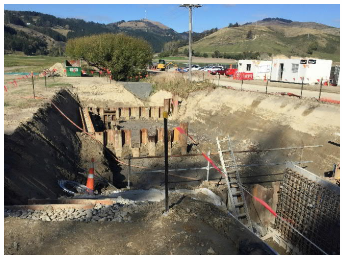
Sheet piles in area of main structure