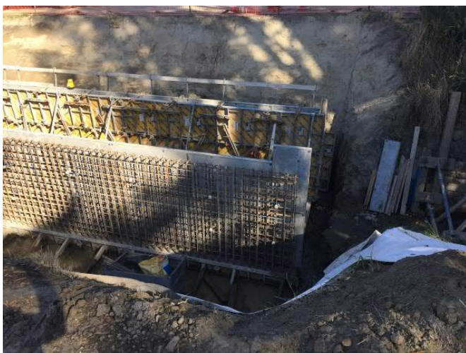
Reinforcement for the concrete walls being prepared

The construction of the control structure involves excavation in the existing Cashmere Valley Drain to allow a U-shaped concrete structure to be installed. This will house 2 bottom hinged gates that will be remotely operated once commissioned. Some images of general construction progress are shown below.