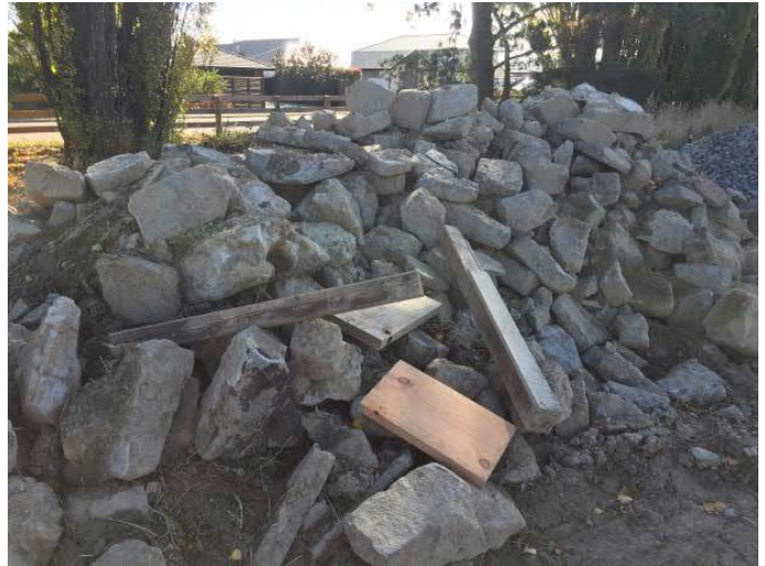
Stone from collapsed section of drain stockpiled for re-use