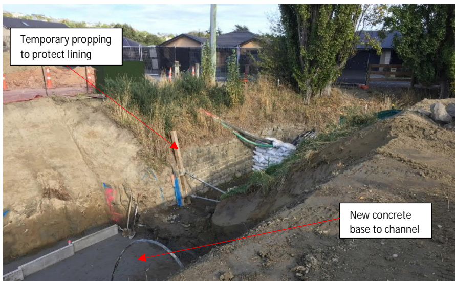
Interface between intact stone lining and area of drain being reconstructed

The stones have been removed and stored and the wall will be reconstructed to tie in with the remaining intact stone lining and the new structure. Below are some images showing how the drain looks and diagrams showing how it will be reconstructed.