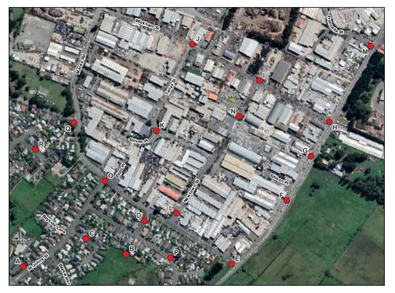
Figure 1: Odour Observation Locations

Sites H and M are immediately downwind of the site, located along Dyers Road with sites G and F. Sites I, J, K, and N are located in the heavy industrial zone. Sites A, C, B, D, P, and R are located in the residential zone around Bayswater Reserve. Sites E, L, O, and Q are located roughly along the residential-industrial boundary. In assessments, Sites E, O, D and Q are in the residential zone, while Site L is in the general industrial zone.