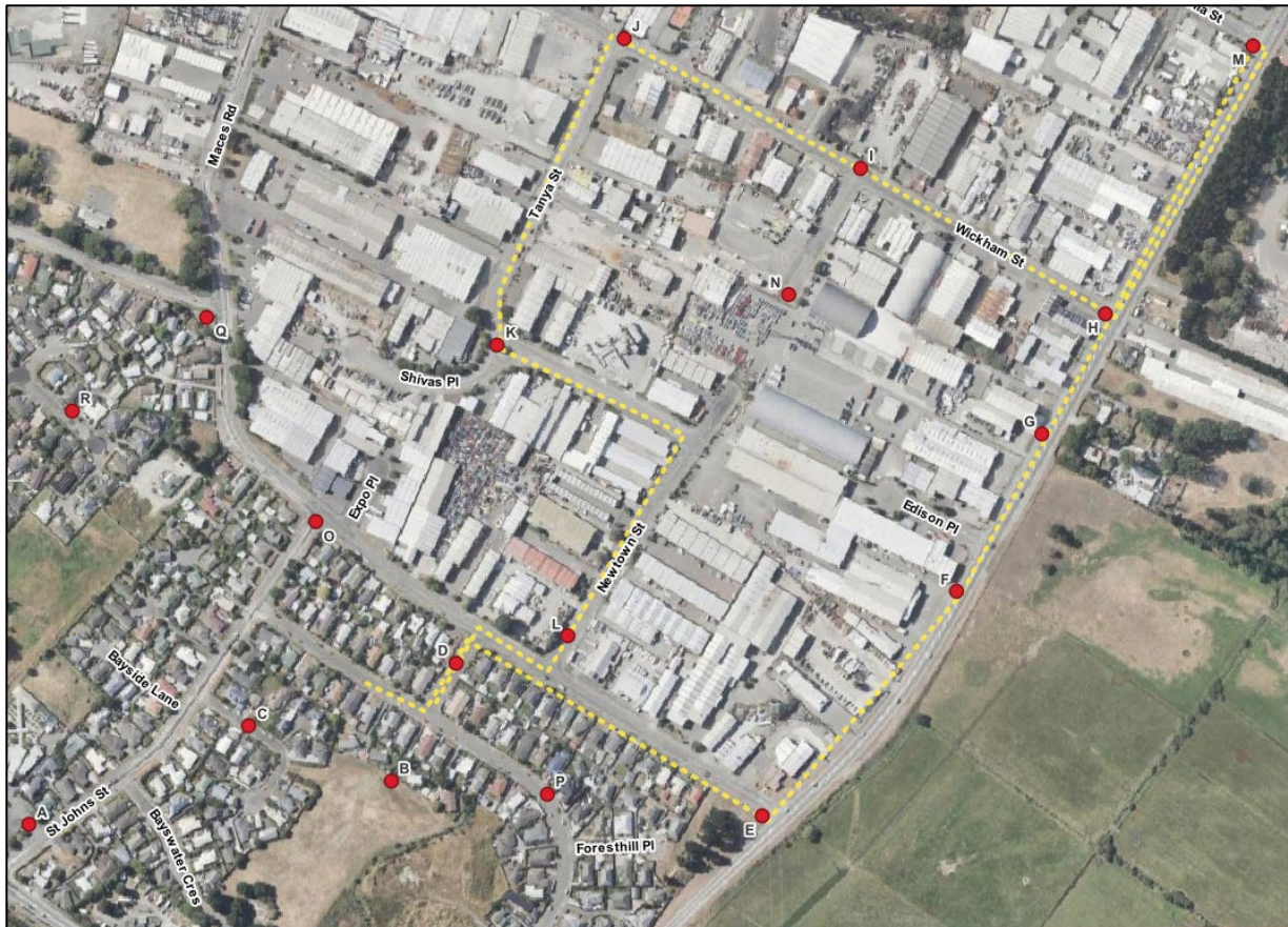
Figure 3: 13 th February 2025 - Odour Scout Route

██████ was the PDP odour scout. The scout was present for approximately 30 minutes. The scout started near Site C, and then walked along the boundary of the industrial area towards Site M, before walking through the industrial area and returning to Site C. North-easterly winds were forecast. The objective was to undertake odour monitoring in the area downwind of the LE Site. The odour scout route (yellow dots) and key scouting locations are shown in Figure 3 .