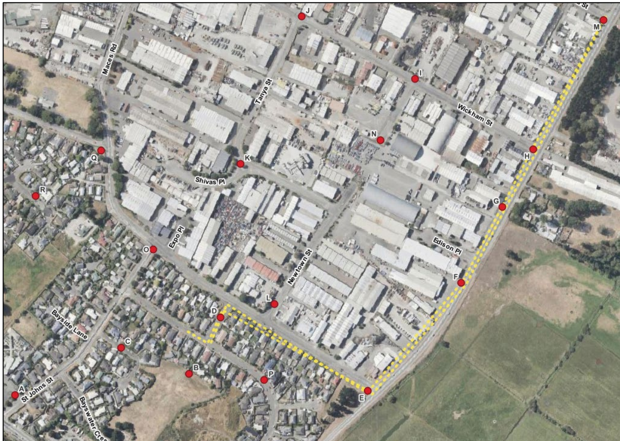
Figure 5: 27 th February 2025 - Odour Scout Route

██████ was the PDP odour scout. The scout was present for approximately 30 minutes. The scout started near Site D, and then walked along the boundary of the industrial area towards Site M, before walking through the industrial area and returning to Site D. North-easterly winds were forecast. The objective was to undertake odour monitoring in the area downwind of the LE Site. The odour scout route (yellow dots) and key scouting locations are shown in Figure 5 .