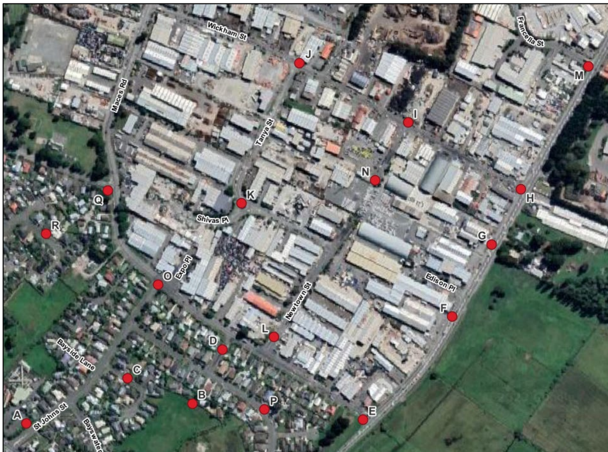
Figure 1: Odour Observation Locations

Sites H and M are immediately downwind of the site, located along Dyers Road with sites G and F. Sites I, J, K, and N are located in the heavy industrial zone. Sites A, C, B, D, P, and R are located in the residential zone around Bayswater Reserve. Sites E, L, O, and Q are located roughly along the residential-industrial boundary. In assessments, Sites E, O, D and Q are in the residential zone, while Site L is in the general industrial zone.