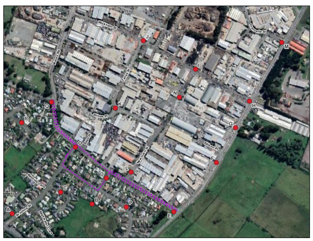
Figure 4: 11th July 2023 - Odour Scout Route

was the PDP odour scout. The scout was present for approximately 30 minutes. The weather was cloudy, with a temperature of 9 °C and east-north-easterly winds with a windspeed of 3.6 m/s as a 10-minute average. The scout started and finished near Site O. The objective was to undertake odour monitoring in the area downwind of the LE Site. The odour scout route (purple dots) and key scouting locations are shown in Figure 4 .