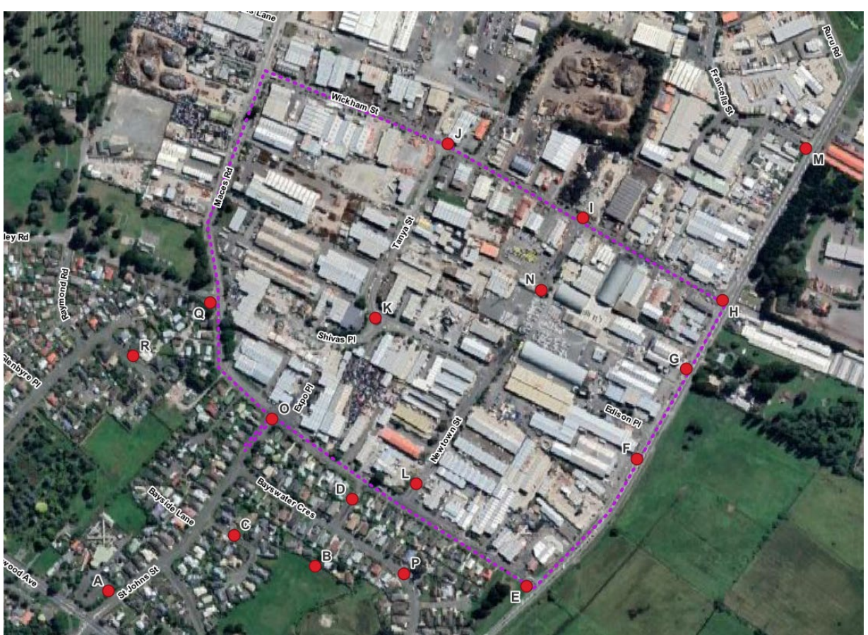
Figure 6: 21st July 2023 - Odour Scout Route

were the PDP odour scouts. The scouts were present for approximately 1 hour. The weather was clear, with an average temperature of 10 °C and easterly winds ranging from 5.7 m/s to 6.3 m/s as a 10-minute average. The scouts started and finished near site O. The objective was to undertake odour monitoring in the area downwind of the LE Site. The odour scout route (purple dots) and key scouting locations are shown in Figure 6 .