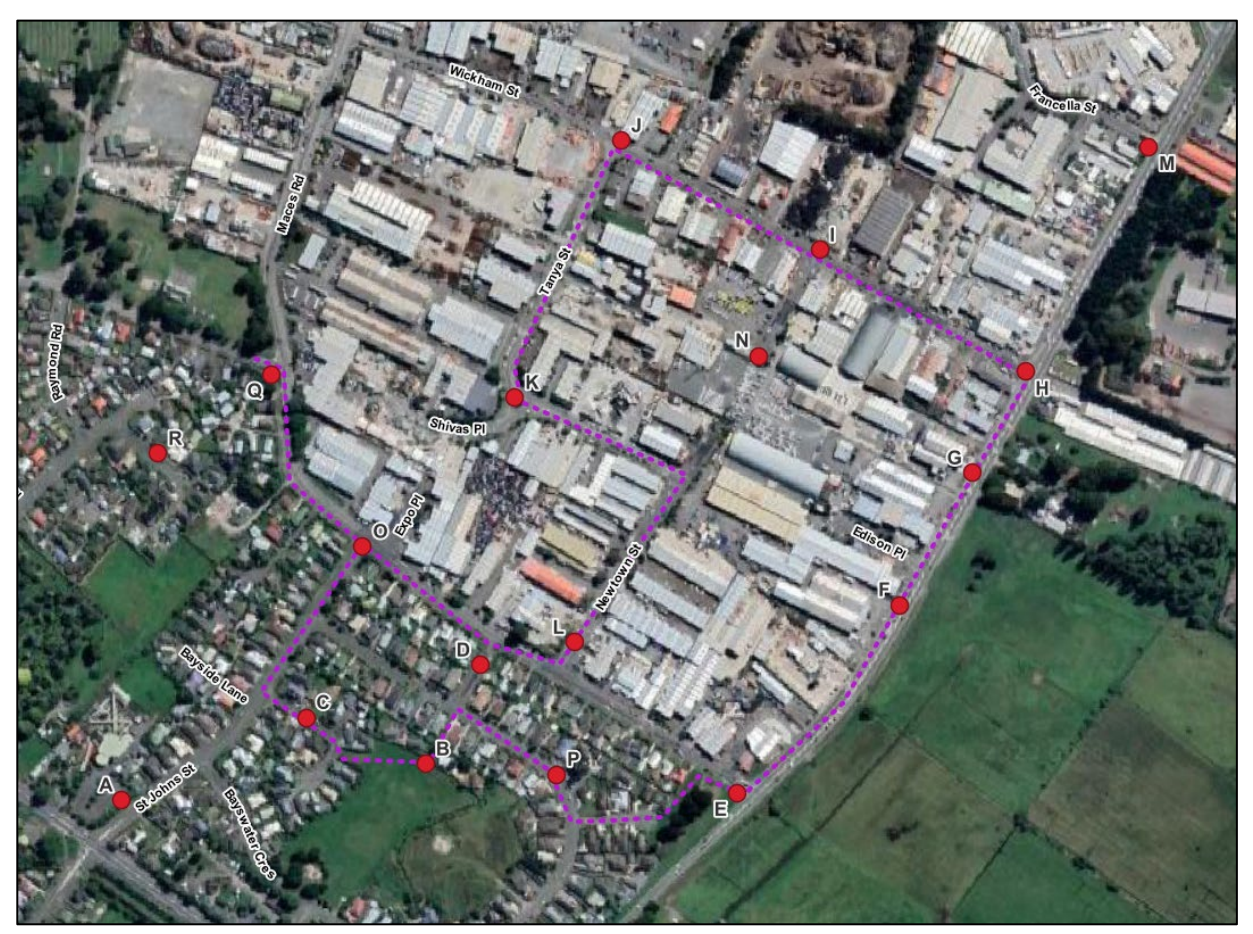
Figure 2: 26th June 2023 - Odour Scout Route

were the PDP odour scouts. The scouts were present for approximately 1 hour. The weather was misty, with an average temperature of 12 °C and easterly winds ranging from 4.1 m/s to 4.6 m/s as a 10-minute average. The scouts started at Site Q, then drove to Site O and walked a loop, finishing back at Site O. The objective was to undertake odour monitoring in the area downwind of the LE Site. The odour scout route (purple dots) and key scouting locations are shown in Figure 2 .