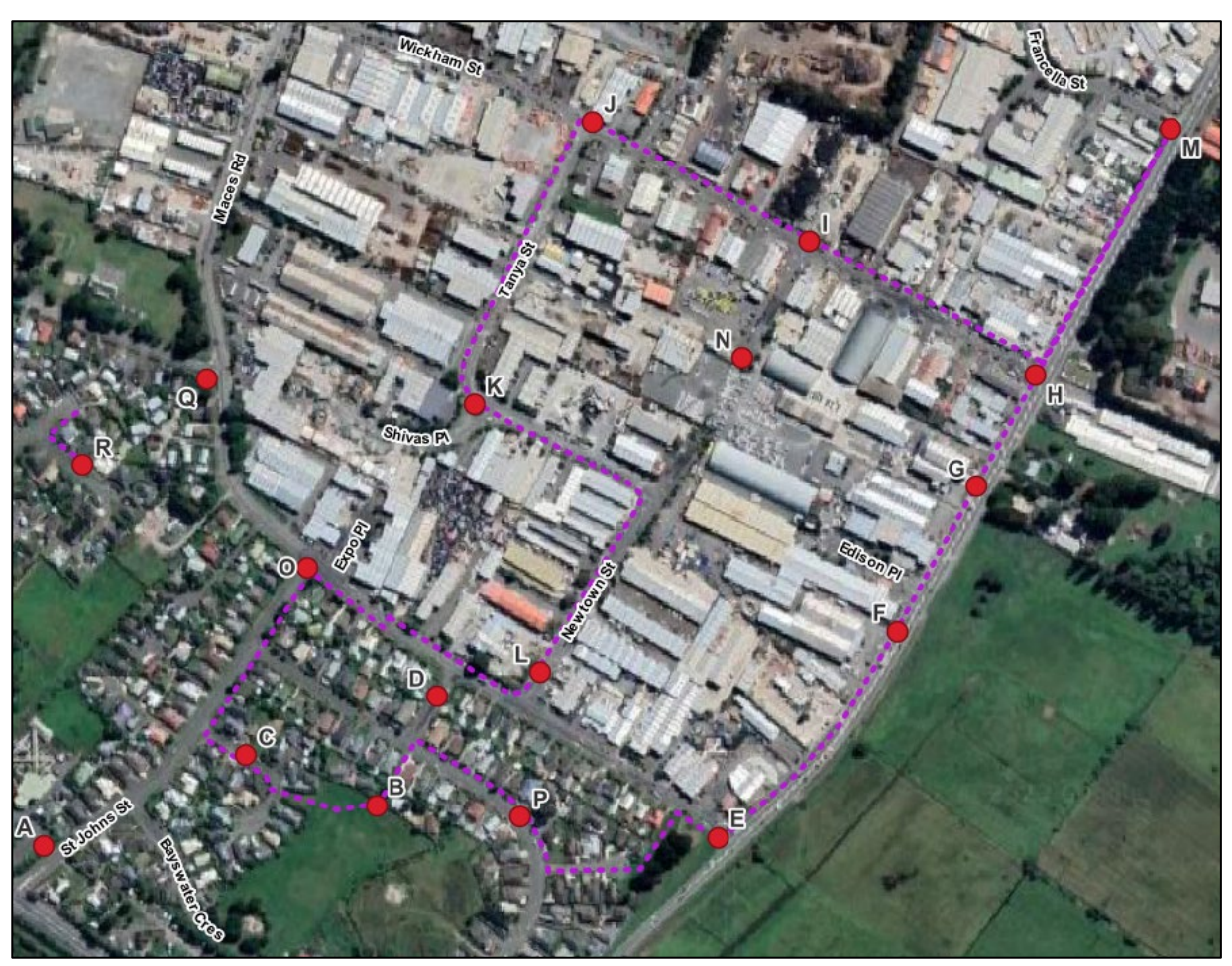
Figure 5: 19<sup>th</sup> July 2023 - Odour Scout Route

were the PDP odour scouts. The scouts were present for approximately 1 hour. The weather was clear, with an average temperature of 17 °C and north-east winds averaging 1 m/s. An observation was made at Site R, then the scouts walked a loop from Site O to Site L through the residential and industrial zones. The odour scout route (blue dots) and key scouting locations are shown in Figure 5 .