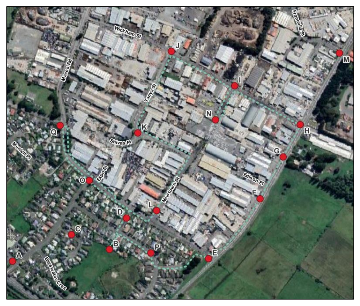
Figure 2: 15th March 2023 - Odour Scout Route

was the PDP odour scout. The scout was present for approximately 1 hour. The weather was clear, with a temperature of 18 °C and an easterly wind ranging from 7.8 m/s to 8.6 m/s as a 10-minute average. The scout started at Site D (Woburn Street) and finished at Site Q (Bromley Road). The object was to undertake odour monitoring across a full cross-section of the area downwind of the LE Site. The odour scout route (green dots) and key scouting locations are shown in Figure 2 .