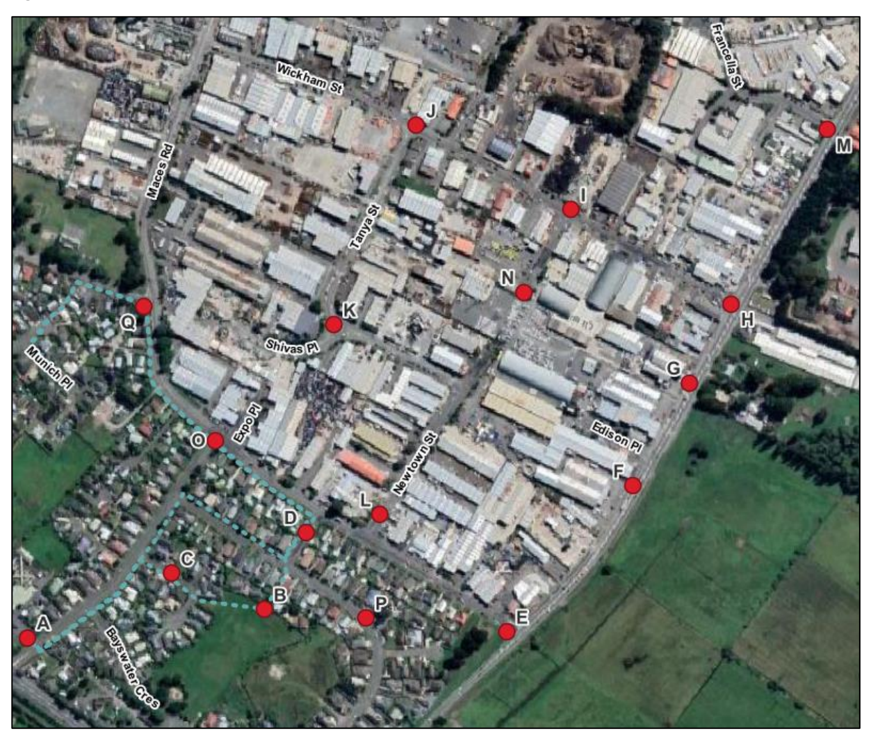
Figure 3: 16<sup>th</sup> March 2023 - Odour Scout Route

was the PDP odour scout. The scout was present for approximately 1 hour. The temperature was 20 °C with windspeeds ranging from 2.8 m/s to 3.9 m/s as a 10-minute average from an E to SE direction. The scout started and finished at Site A. The scout worked a loop through the residential zone following detected odour. The odour scout route (teal dots) and key scouting locations are shown in Figure 3 .