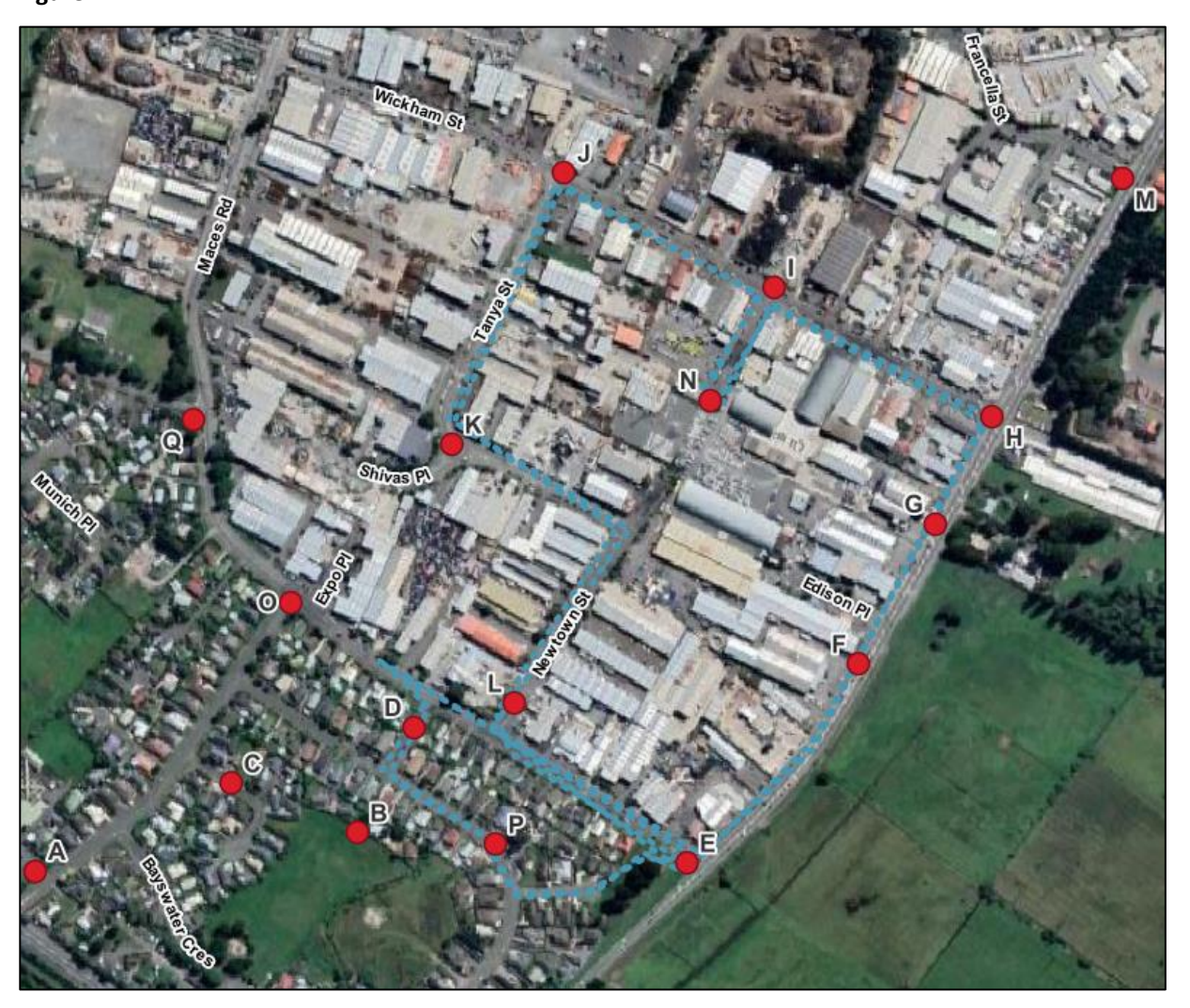
Figure 4: 17th March 2023 - Odour Scout Route

was the PDP odour scout. The scout was present for approximately one hour. The temperature was 23 °C with windspeeds ranging from 6.0 m/s to 6.6 m/s as a 10-minute average. The wind was predominately coming from an WNW direction. The forecast on the day was for a NE shift in the afternoon. Ground conditions on the afternoon were from a more W direction than expected. The scout started and finished at Site D. The odour scout route (blue dots) and key scouting locations are shown in Figure 4 .