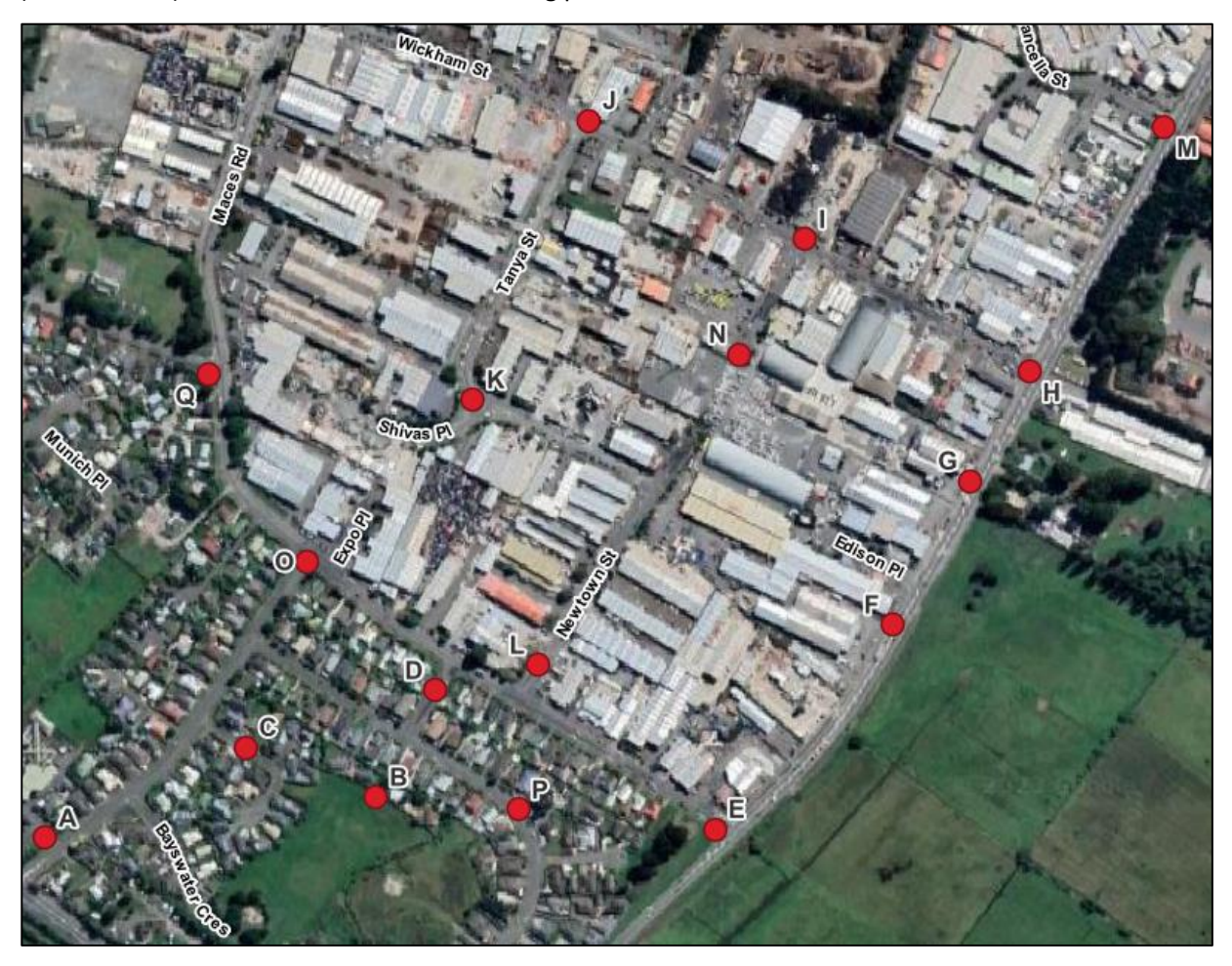
Figure 1: Odour Observation Locations

Sites H and M are immediately downwind of the site, located along Dyers Road with sites G and F. Sites I, J, K, and N are located in the heavy industrial zone. Sites A, C, B, D, and P are located in the residential zone around Bayswater Reserve. Sites E, L, O and Q are located roughly along the residential-industrial boundary. In assessments, Sites E, O, and Q are used to represent the closest (to the LE Site) downwind edge of the residential zone. Site L is located in the general industrial zone - Site D is used as the closest (to the LE Site) downwind residential monitoring point in this area.