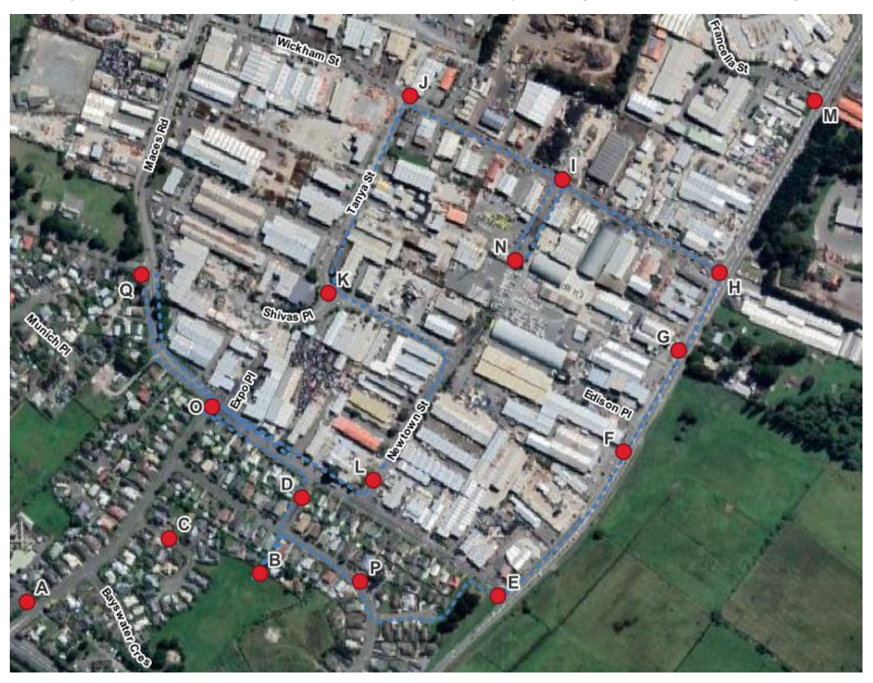
Figure 5: 24th March 2023 - Odour Scout Route

was the PDP odour scout. The scout was present for approximately two hours. The temperature was 16 °C with windspeeds ranging from 6.6 m/s to 7.5 m/s as a 10-minute average from an ENE to E direction. The scout completed a loop through the industrial and residential areas, starting and finishing near Site O. The odour scout route (blue dots) and key scouting locations are shown in Figure 5 .