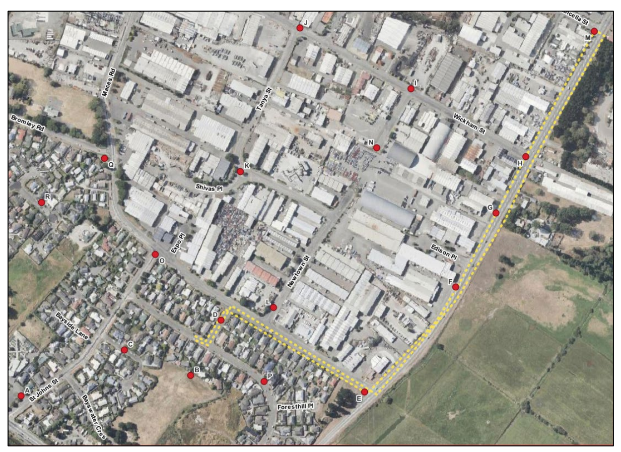
Figure 3: 23<sup>rd</sup> October 2024 - Odour Scout Route

was the PDP odour scout. The scout was present for approximately 1 hour. The scout started near Site D, and then walked along the boundary of the industrial area towards Site M, then returning to Site D. Conditions were forecast for north-easterly conditions, however analysis of daily mean meteorological data has shown westerly winds for the 22<sup>nd</sup> of October. The objective was to undertake odour monitoring in the area downwind of the LE Site. The odour scout route (yellow dots) and key scouting locations are shown in Figure 3 .