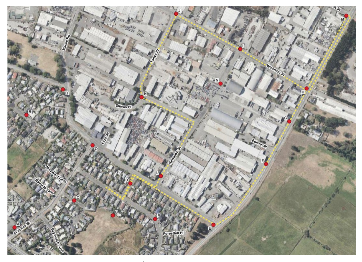
Figure 5: 30<sup>th</sup> January 2025 - Odour Scout Route

Results from the odour scout are shown below. Entries within Table 4 that are highlighted blue denote locations within a residential zone and purple denotes locations within an industrial zone.