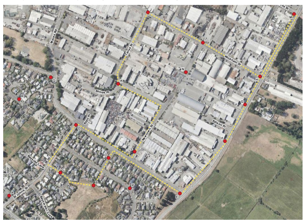
Figure 2: 7th January 2025 - Odour Scout Route

Fergus Robertson was the PDP odour scout. The scout was present for approximately 45 minutes. The scout started near Site C, and then walked along the boundary of the industrial area towards Site M, before walking through the industrial area and returning to Site C. North-easterly winds were forecast. The objective was to undertake odour monitoring in the area downwind of the LE Site. The odour scout route (yellow dots) and key scouting locations are shown in Figure 2 .