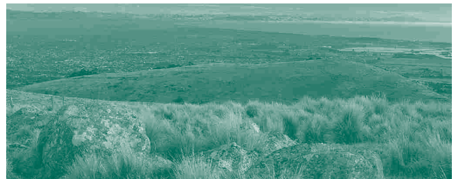
View from the Port Hills looking over Pegasus Bay.

There are no walking tracks through the Ahuriri Scenic Reserve, however there is a good network of walking tracks in the nearby Kennedy's Bush Scenic Reserve. Remnants of native forest can also be found at Otahuna and Cass Peak