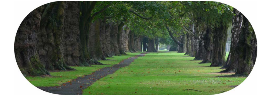
The present day in the Christchurch Botanic Gardens