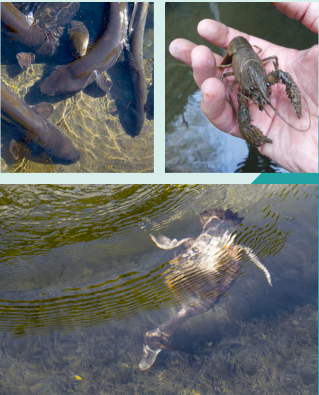
Images below clockwise from top left: tuna/eels, kōura/freshwater crayfish, scaup/native duck.

Water that is safe for humans to swim in is just one measure of a healthy waterway. Water also needs to be safe for birds, fish and invertebrates, and we need to ensure that aquatic plants and algae don’t take over and choke stream channels, which can affect the ecology of waterways and increase flooding risk.