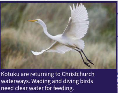
Kotuku are returning to Christchurch waterways. Wading and diving birds need clear water for feeding.