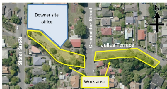
Map 1—Location of work