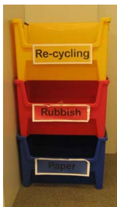
Central recycling station