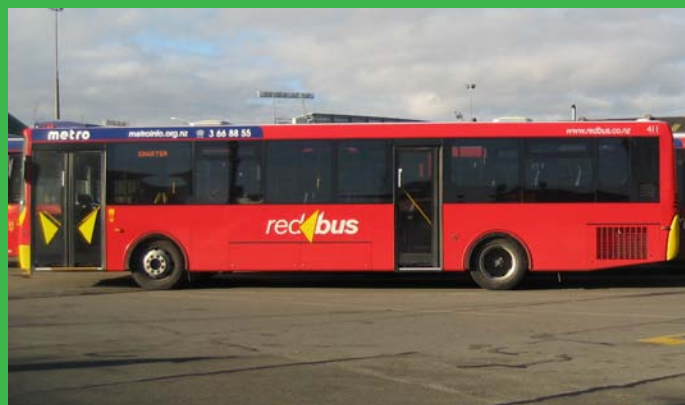
Buses at the Red Bus Depot on Ferry Road