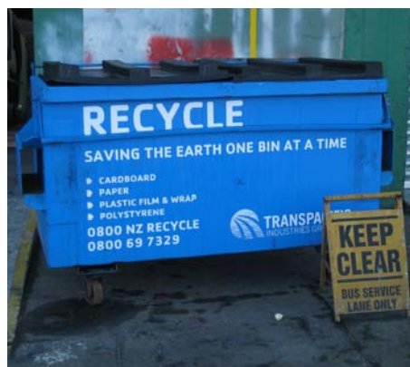
Cardboard, paper, plastic wrap and polystyrene recycling