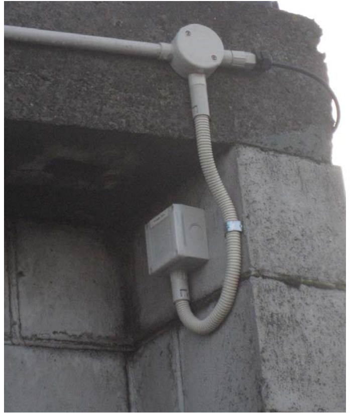
Daylight sensors on the yard lighting © Copyright