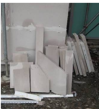
Celcrete off-cuts for reuse on-site