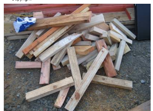
Timber off-cuts in separate piles for reuse