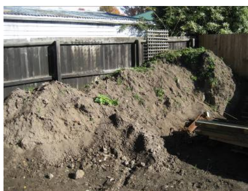
Soil stockpiled for reuse on-site