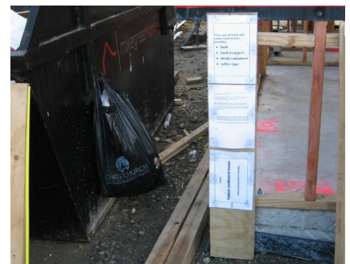
Signs asking sub-contractors to put wet waste in the black bag