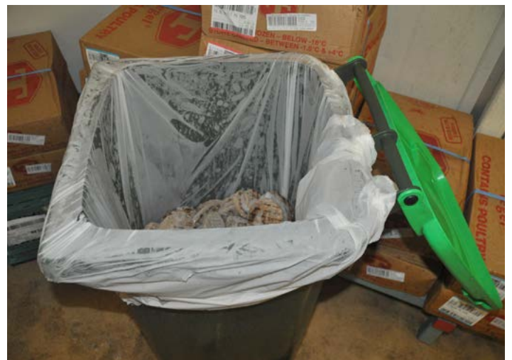
Organics recycling bin in the deli department