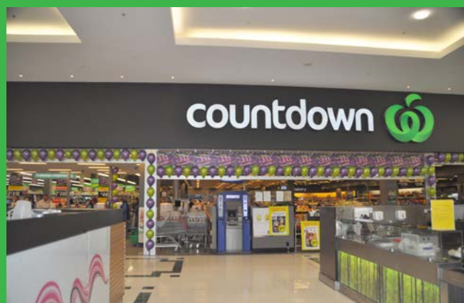
Countdown The Palms © Copyright