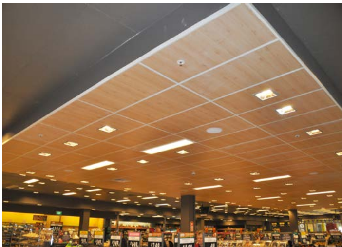
New energy efficient lighting configuration