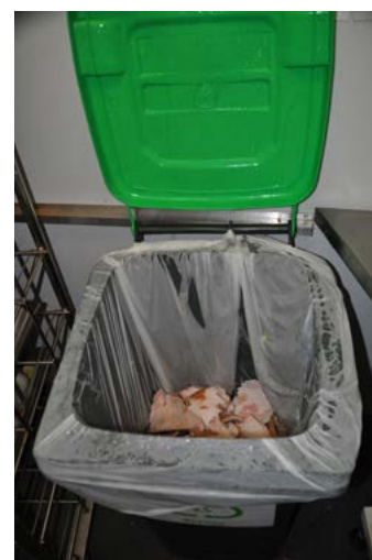
Organics recycling bin in the butchery department