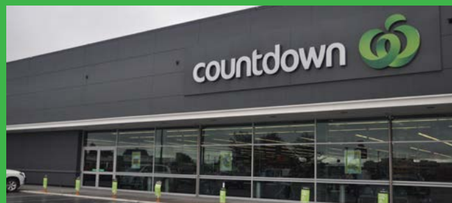
Countdown Hornby © Copyright