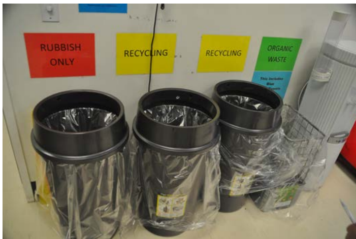
Co-mingled recycling in the staff cafeteria