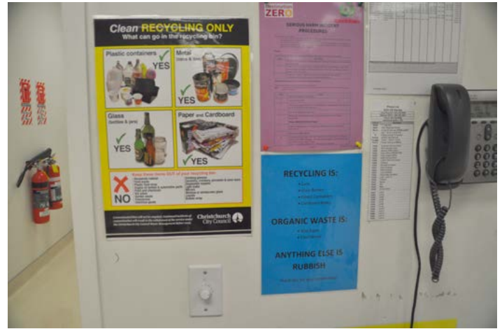
Recycling signage in the staff cafeteria