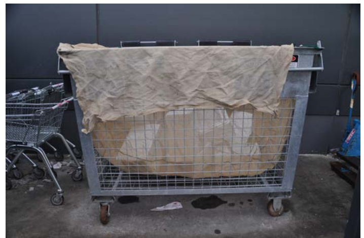
Plastic recycling collection system for polystyrene, coreflute boxes and plastic strapping