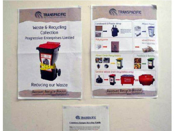
Recycling signage and information in the office area