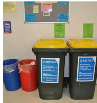
Co-mingled recycling bin in the staff cafeteria