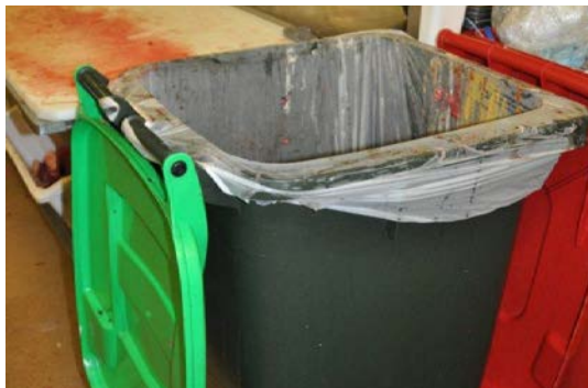
Organics recycling bin in the butchery