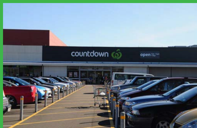
Countdown Eastgate