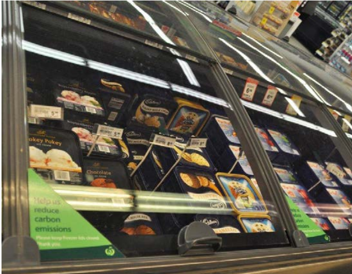
New coffin freezer lids

The estimated electricity saving is based on electricity use calculations that take into account parameters such as temperature differential between the refrigerator and the surrounding ambient temperature, size of refrigeration area and heat infiltration coefficient to determine heat transfer loads.