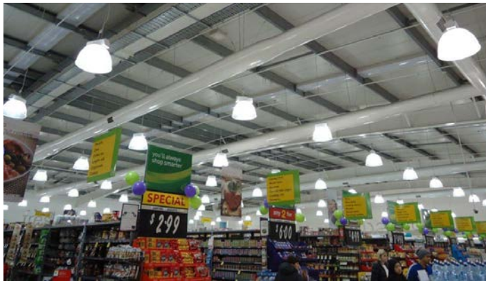
Upgraded HVAC system