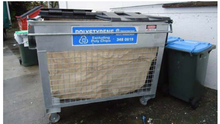
Polystyrene recycling collection cage