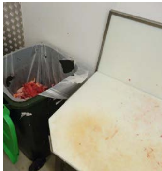
Organics recycling bin in the butchery