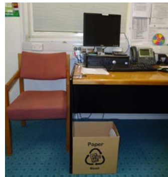
Paper recycling in one of the offices