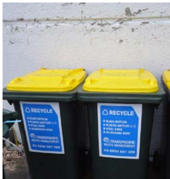
Co-mingled recycling bins at the point of collection