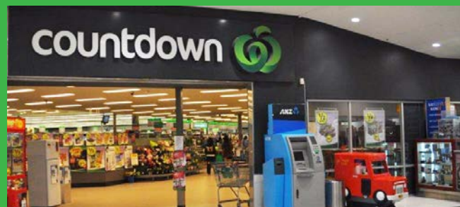
Countdown Bush Inn