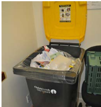
Co-mingled recycling in the office area