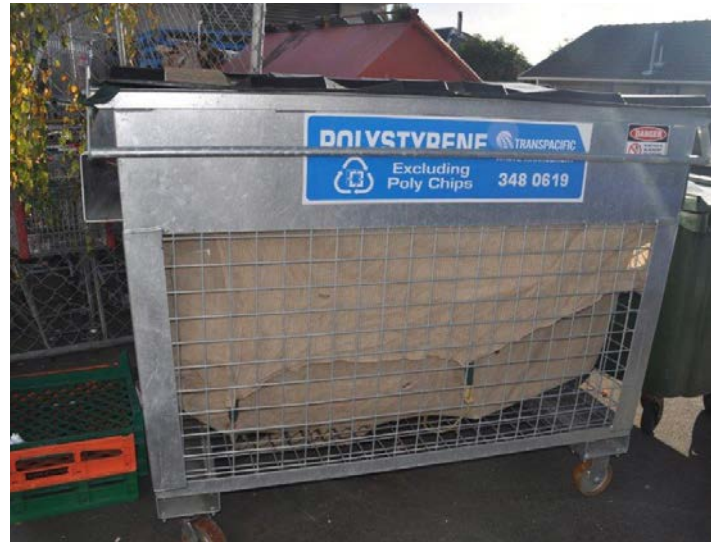
Polystyrene recycling collection cage

The estimated electricity saving is based on electricity use calculations that take into account parameters such as temperature differential between the refrigerator and the surrounding ambient temperature, size of refrigeration area and heat infiltration coefficient to determine heat transfer loads.