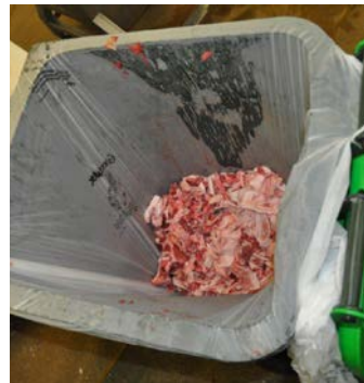
Organic recycling bin in the butchery