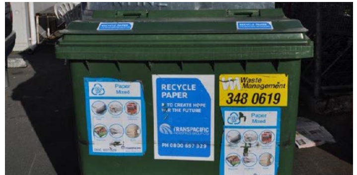
Paper recycling collection container