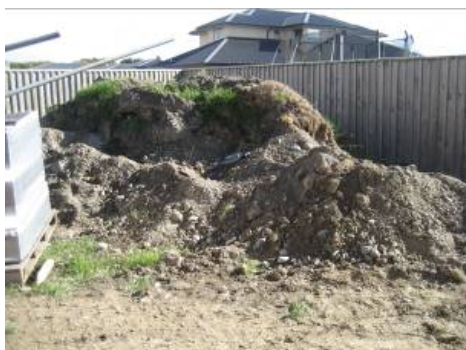
Soil stockpiled for reuse on-site