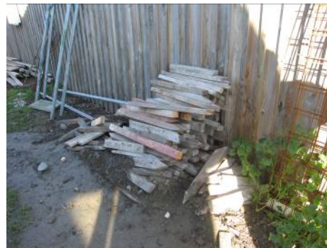
Timber off-cuts for reuse