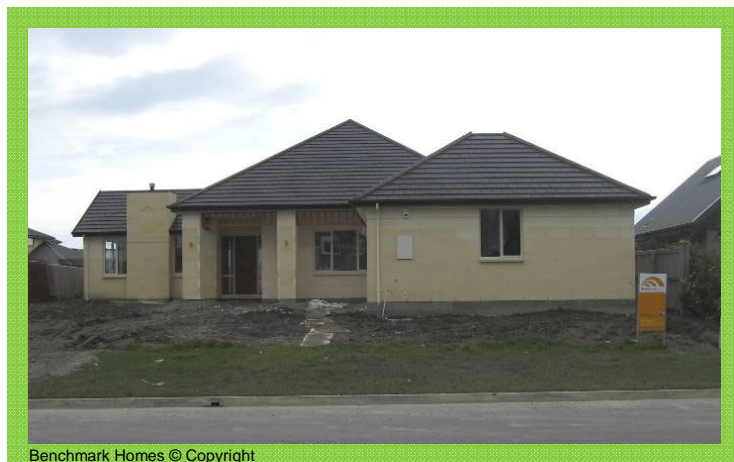
Benchmark Homes © Copyright