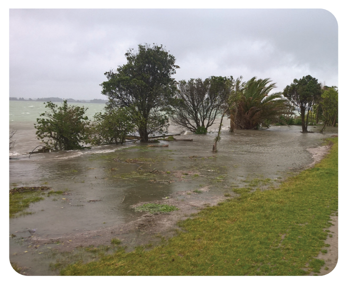
Flooding in Southshore caused by heavy rainfall and storm surge, July 2017.

It is common for land to keep sinking after large earthquakes. While there is no sign the sinking has slowed down in Christchurch, evidence from other parts of the world tells us that, eventually, the speed of vertical land movement will return to normal. However, it might take another few decades and will depend on whether we experience more large earthquakes.