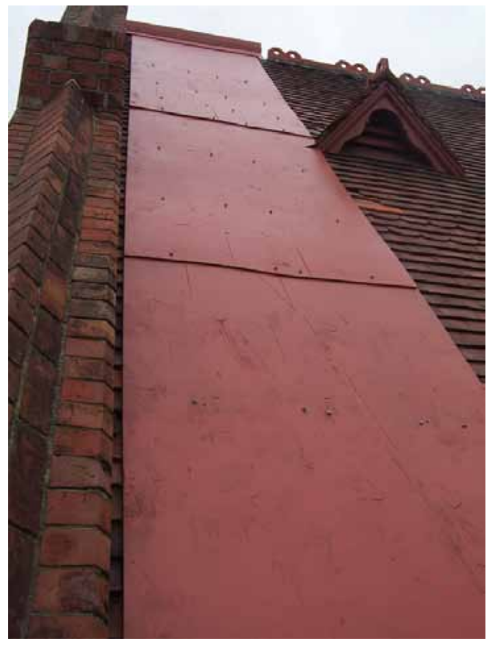
Painted plywood provides weatherproofing.