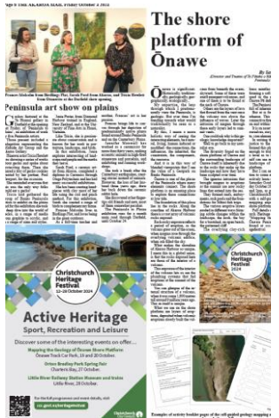
Akaroa Mail - 4 October