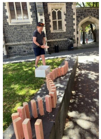
Heritage Fun Zone - Te Matatiki Toi Ora The Arts Centre