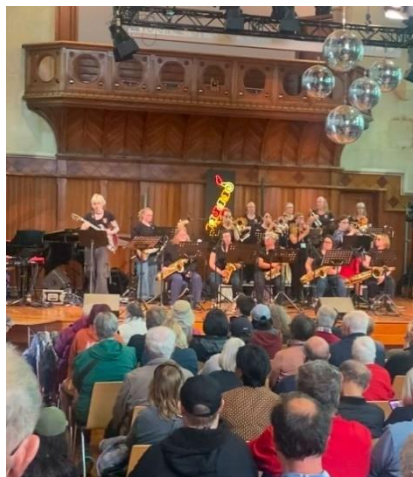
70s Big Band Blast - Te Matatiki Toi Ora The Arts Centre