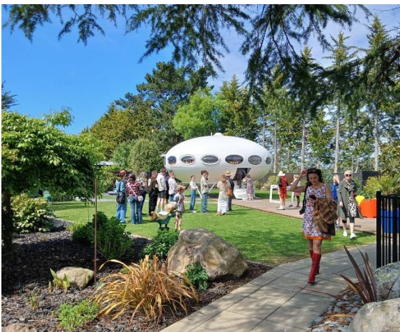
Futuro House Open Day – Heritage New Zealand Pouhere Taonga and Futuro House

Some larger event providers such as Te Matatiki Toi Ora The Arts Centre, Heritage New Zealand Pouhere Taonga, Christchurch City Libraries, the Christchurch Art Gallery, UC Teece Museum and the Canterbury Community Gardens Association held multiple events. Among the larger events enjoyed were the Orton Bradley Park Spring Fair, the Avebury House Open Day and the Heritage New Zealand Pouhere Taonga Futuro House Open Day.