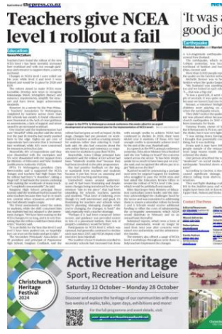
The Press - 2 October