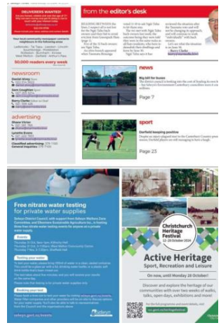
Selwyn Times - 16 October