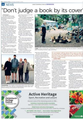
The Star Communities - 8 October