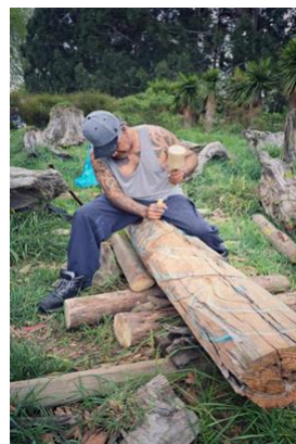
Hīkoi ki Kāpūtahi – take a walk on the wild side – Styx Living Laboratory Trust