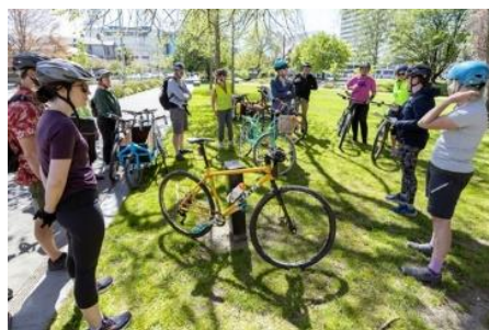
Kate Sheppard Ride – Spokes Canterbury/Heritage New Zealand Pouhere Taonga