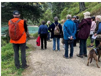
Whakaraupō Time Warp Walk – Te Ūaka The Lyttelton Museum