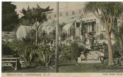
Woolmer Park, Christchurch, N. Z.