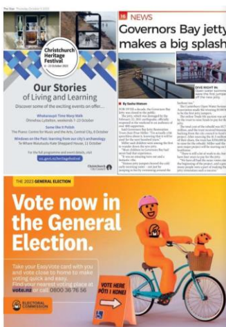
The Star - 5 October