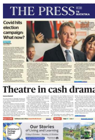
The Press - 17 October