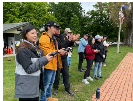
Introduction to Radio Controlled Model Yacht Sailing - Christchurch Model Yacht Club