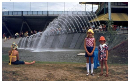
History & Heritage | 25 Sep 2023