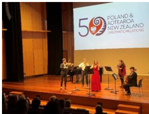
Some like it Polish – 'Between the Waters' – Polish Legacy in New Zealand Trust