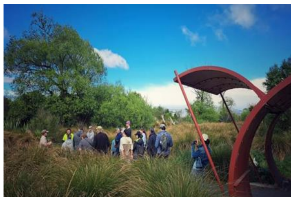
Hīkoi ki Kāpūtahi – take a walk on the wild side – Styx Living Laboratory Trust