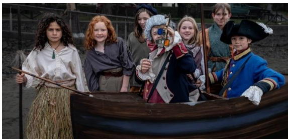
Akaroa French Festival 2023 'Landings' – Akaroa Heritage Festival Society - We were so fortunate to have the support of Akaroa Area School children, who learned all about what it's like to be in a play and absolutely loved their experience.