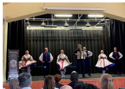
Accordian in Slavic Folklore: Past – Present – Future – Polonus Polish Folk Dance Group