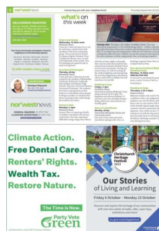
The Star Communities - 28 September