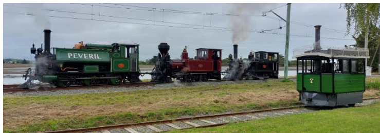
Ferrymead Heritage Park Extravaganza - It was a rare opportunity to have some of the oldest forms of rail transportation in the world operating: Trains: The F13, built 1872, the D140 built in 1888 and the D16 built in 1878 and the world's only operating Kitson steam tram No.7 built 1881.

Attendance across the programme overall was good. Unsettled weather during mid-October, particularly the high winds in the middle weekend of the festival, did result in a few events having to be cancelled, postponed or reduced in scale. There were a large number of talks in the programme this year, some of which attracted smaller numbers than previous years, possibly due to the number of talks in the programme. Overall attendance across the programme was good, with many event providers satisfied or very satisfied with the number of attendees at their event.