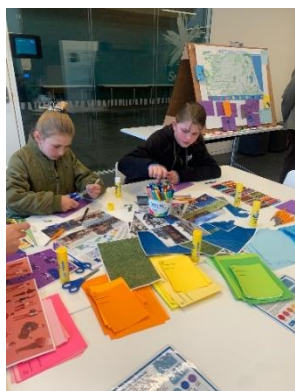
Memory Map of Learning – Te Pūtahi Centre for Architecture and City Making