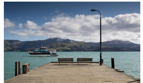
6 Oct 2023