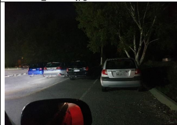
AP #82c Attachment Rowing-club-carpark-6am-20230228_060125.jpg