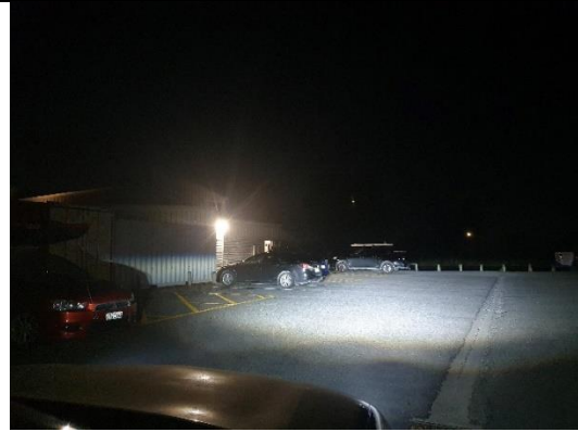
AP #82b Attachment - Kayak-club-other-side-6am-20230228_060236.jpg