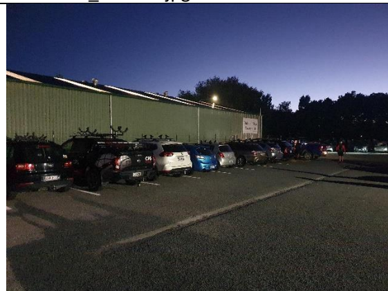
AP #82f Attachment Kayak-club-0615am-20230228_061723.jpg