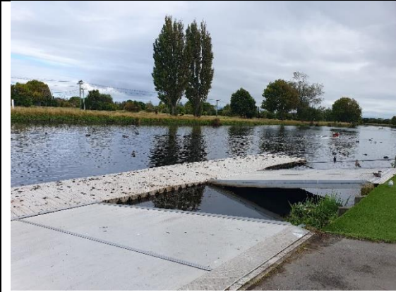
AP #82a Attachment - Pontoon-with-bird-poo-20230226_100501.jpg