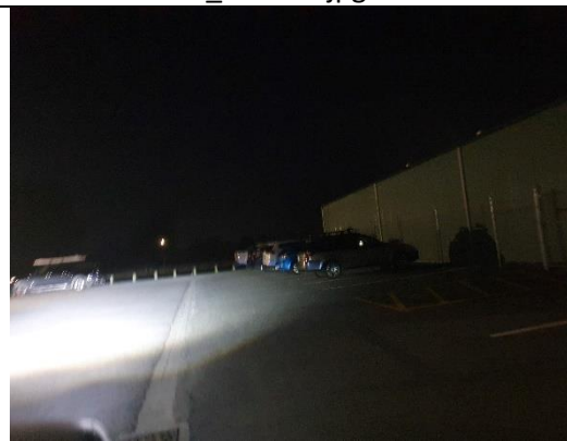
AP #82d Attachment Kayak-club-6am-20230228_060231.jpg