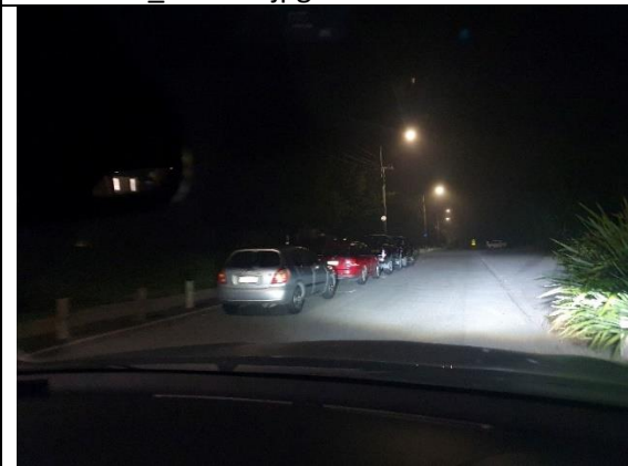
AP #82e Attachment Waka-paddlers-vehicles-6am-20230228_060157.jpg