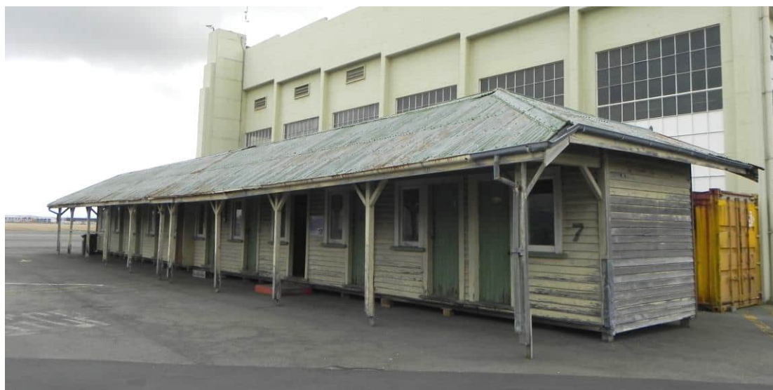
PHOTOGRAPH : M.VAIR-PIOVA, 13/01/2015