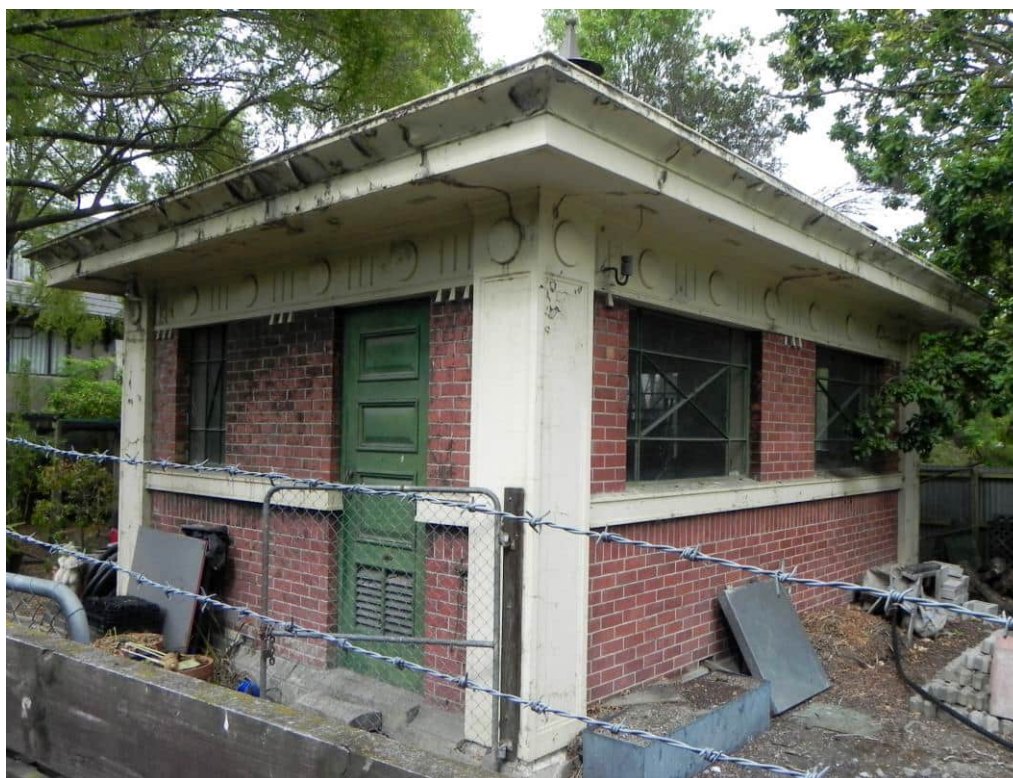
PHOTOGRAPH: M.VAIR-PIOVA, 23/12/2014