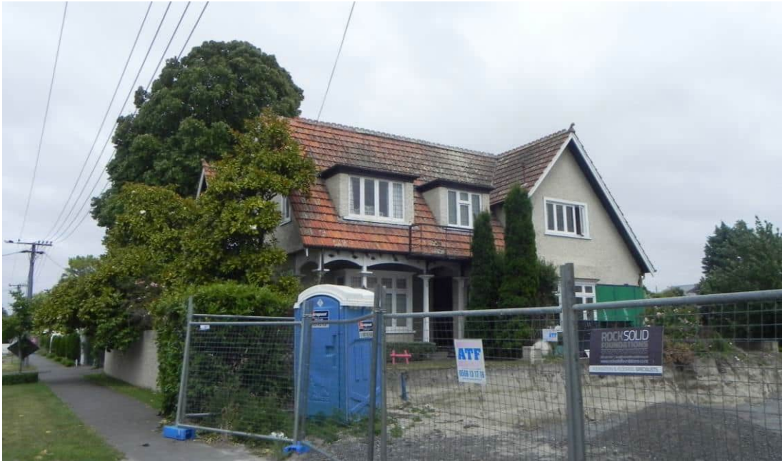
PHOTOGRAPH: M.VAIR-PIOVA, 17/12/2014