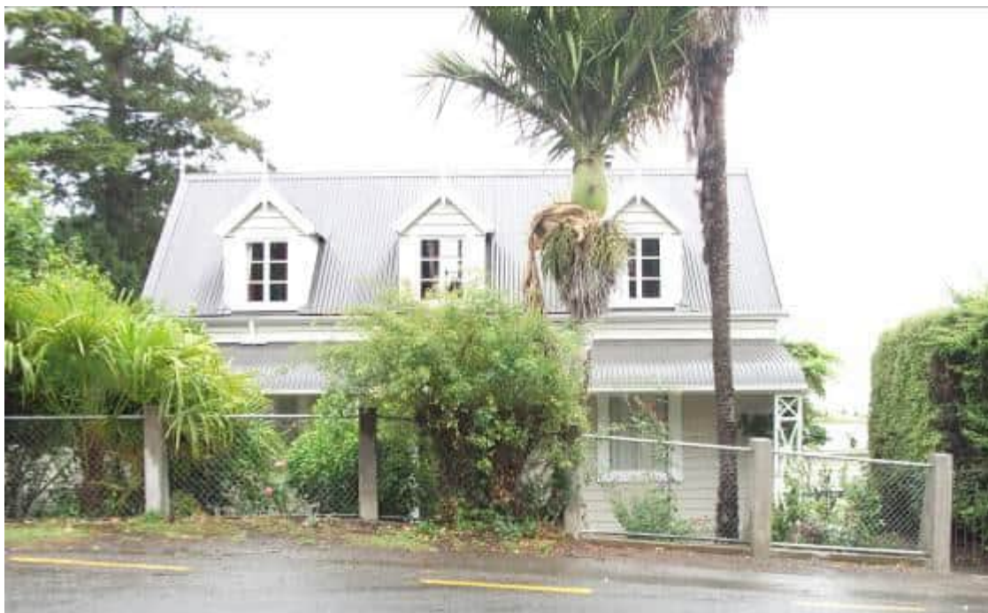
PHOTOGRAPH: ROSEMARY BAIRD, 2011