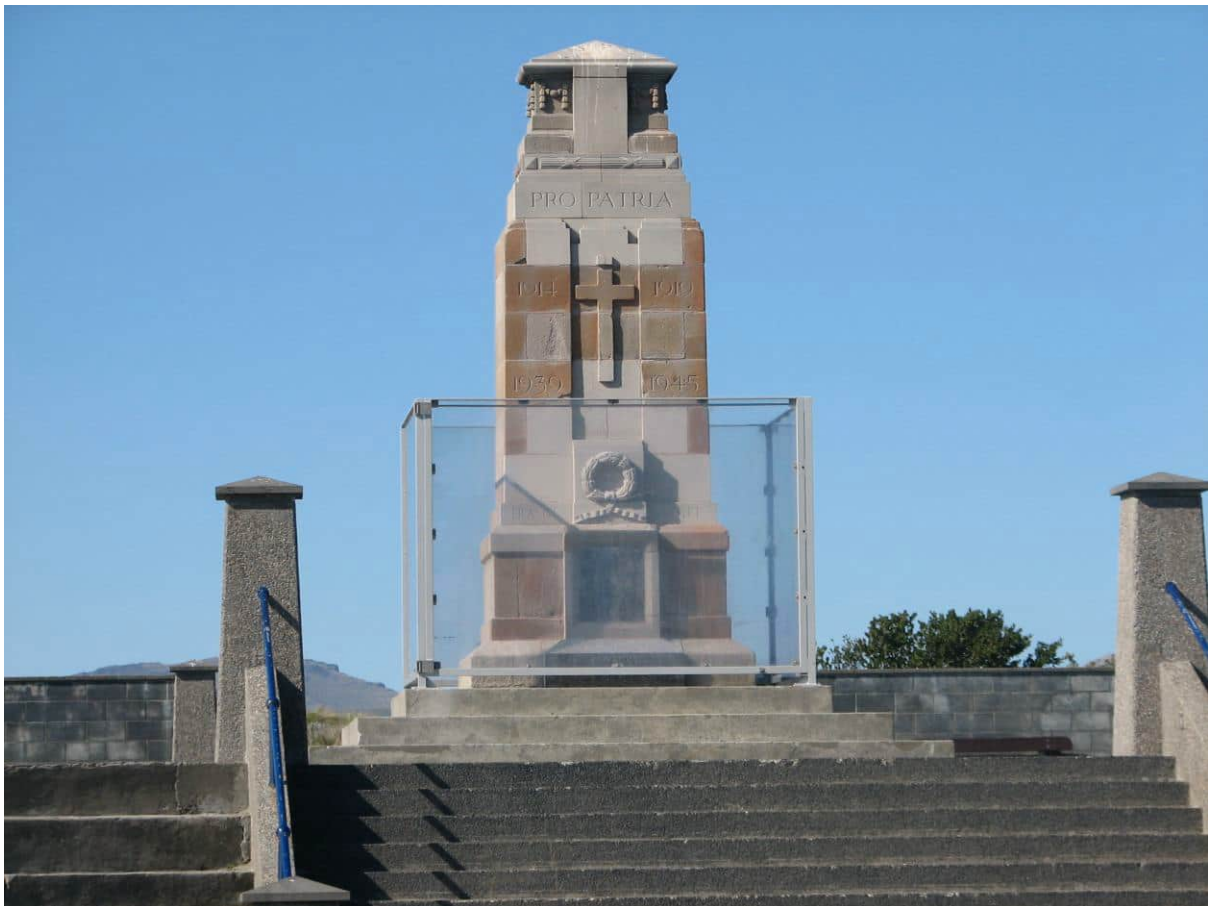
PHOTOGRAPH: G. WRIGHT, 1/10/2021