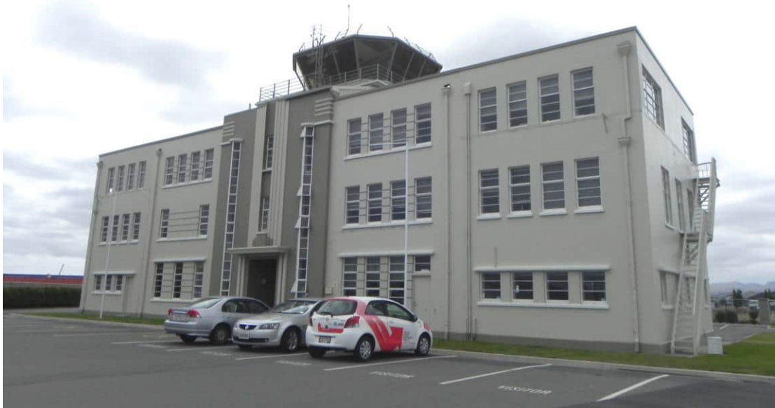
PHOTOGRAPH : M.VAIR-PIOVA, 8/01/2015