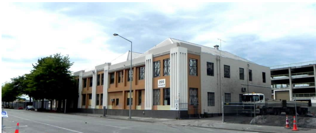
PHOTOGRAPH : 9/12/2014, M.VAIR-PIOVA