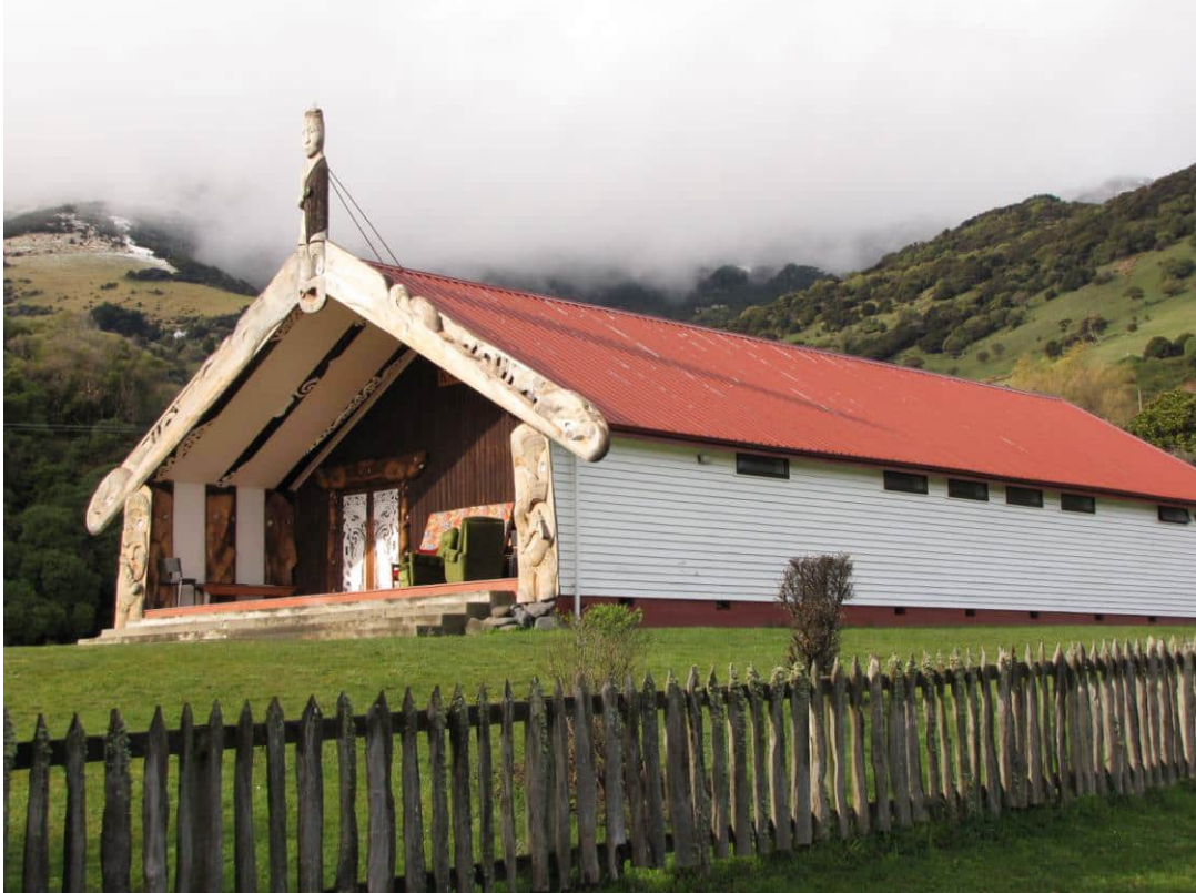
19 JULY 2009