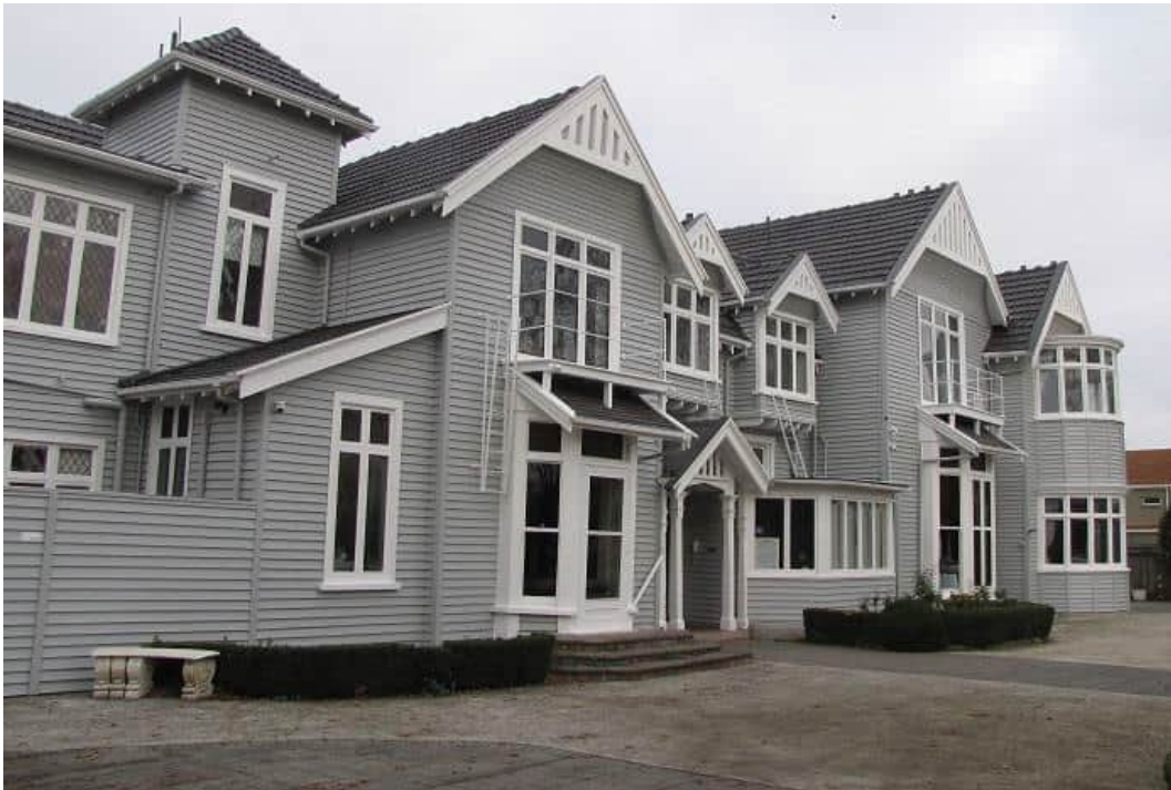
PHOTOGRAPH : B SMYTH, 2021