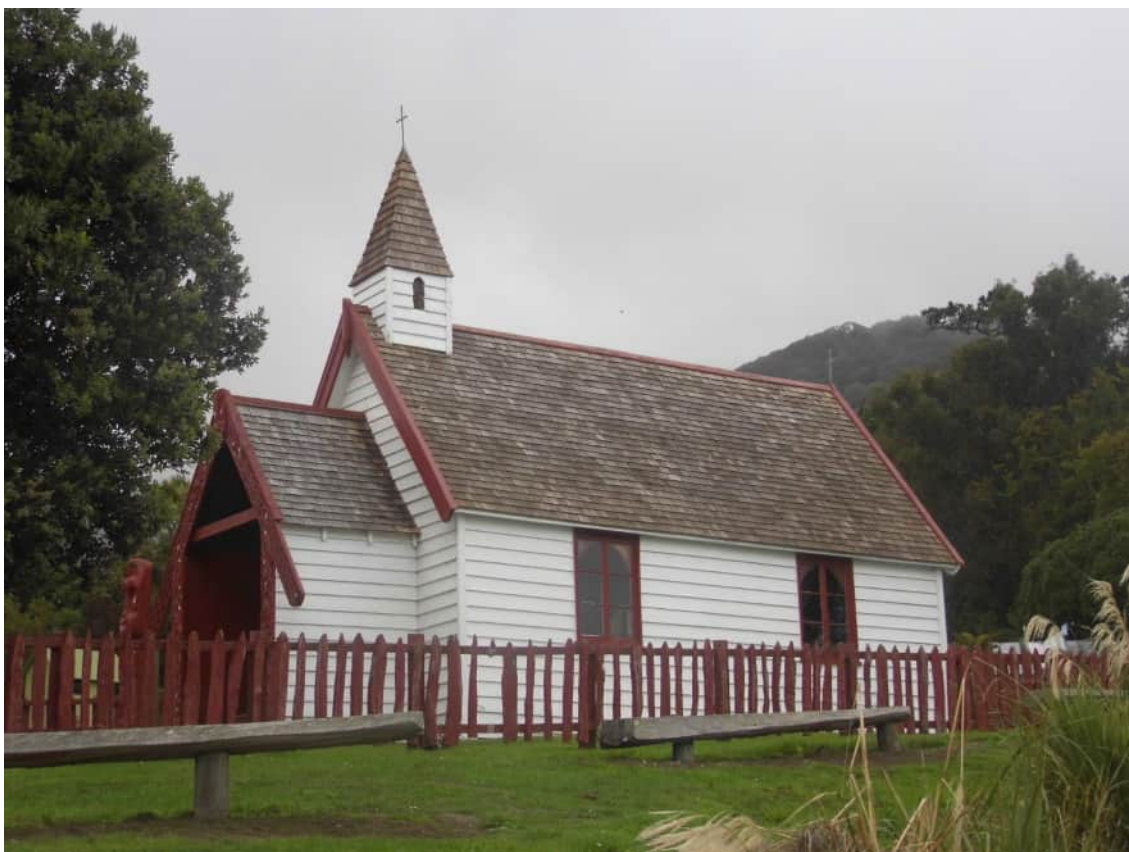
PHOTOGRAPH : ROSEMARY BAIRD, 2013