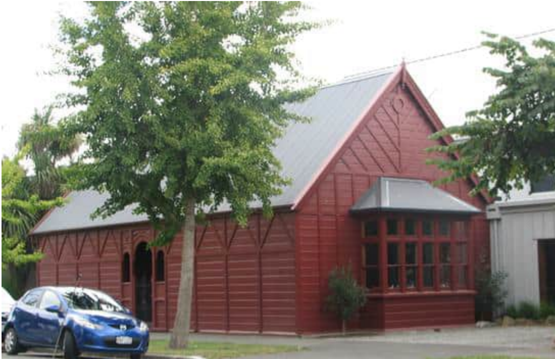
PHOTOGRAPH: D COSGROVE 2021