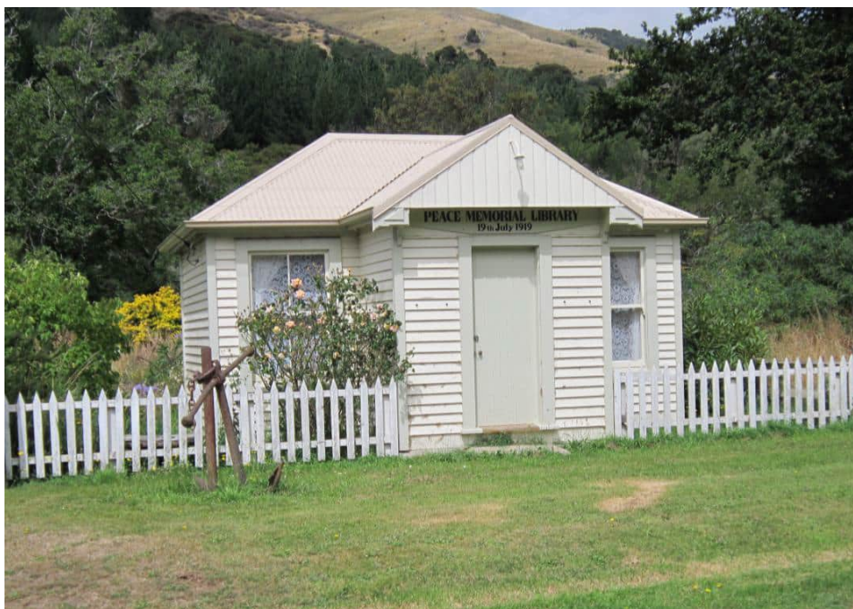
PHOTOGRAPH : CLARE KELLY, 2014