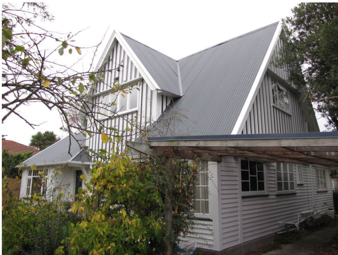
PHOTOGRAPH: BRENDAN SMITH, 2011