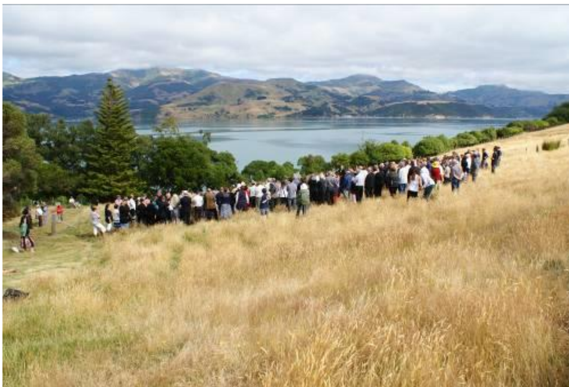
Guests gathered for the formal blessing ceremony at Takapūneke Historic Reserve, 5 February 2010.