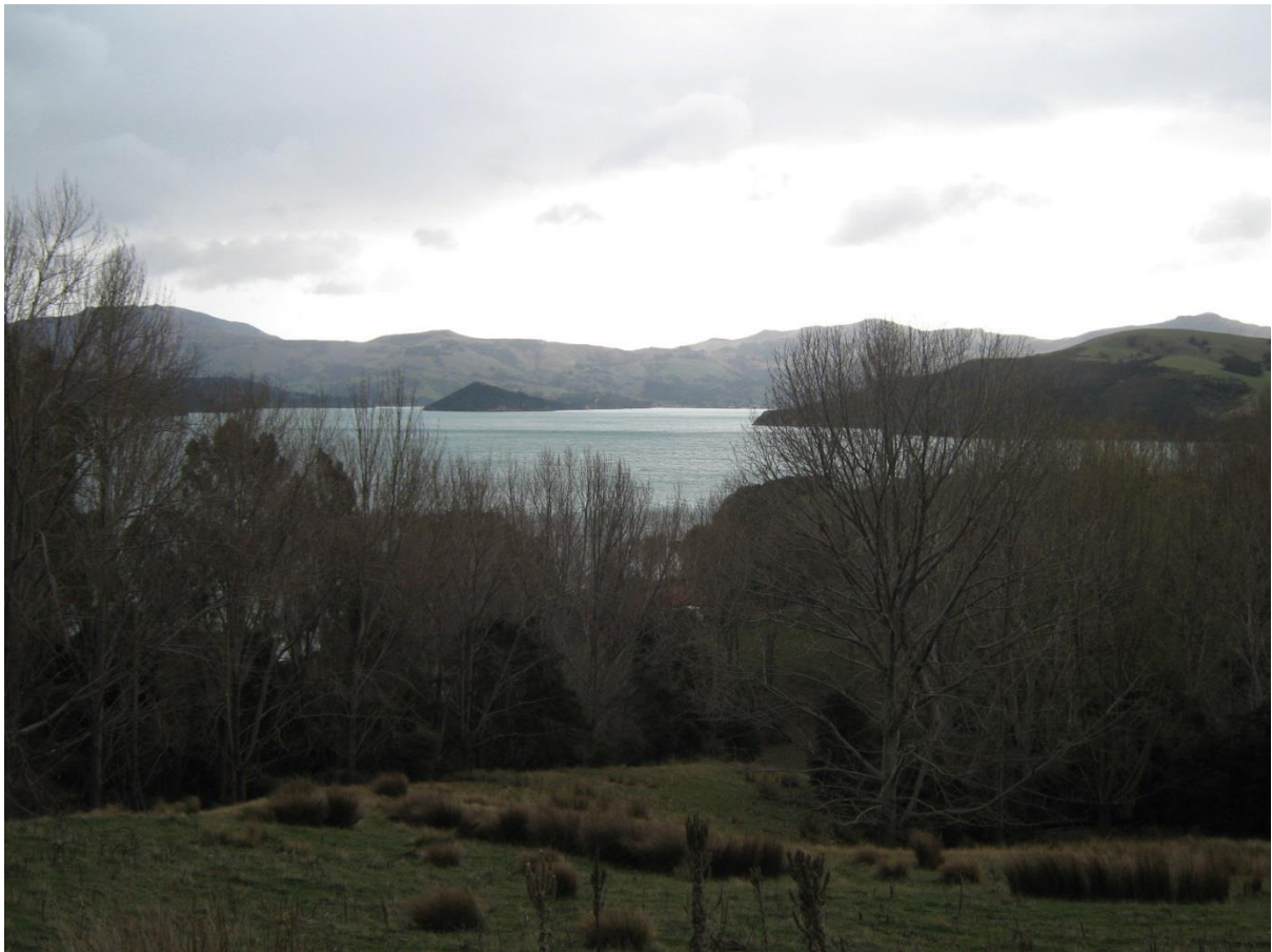
Takapūneke Reserve – looking from Te Wahi Ao o Takapūneke towards Ōnawe – Views to be retained.