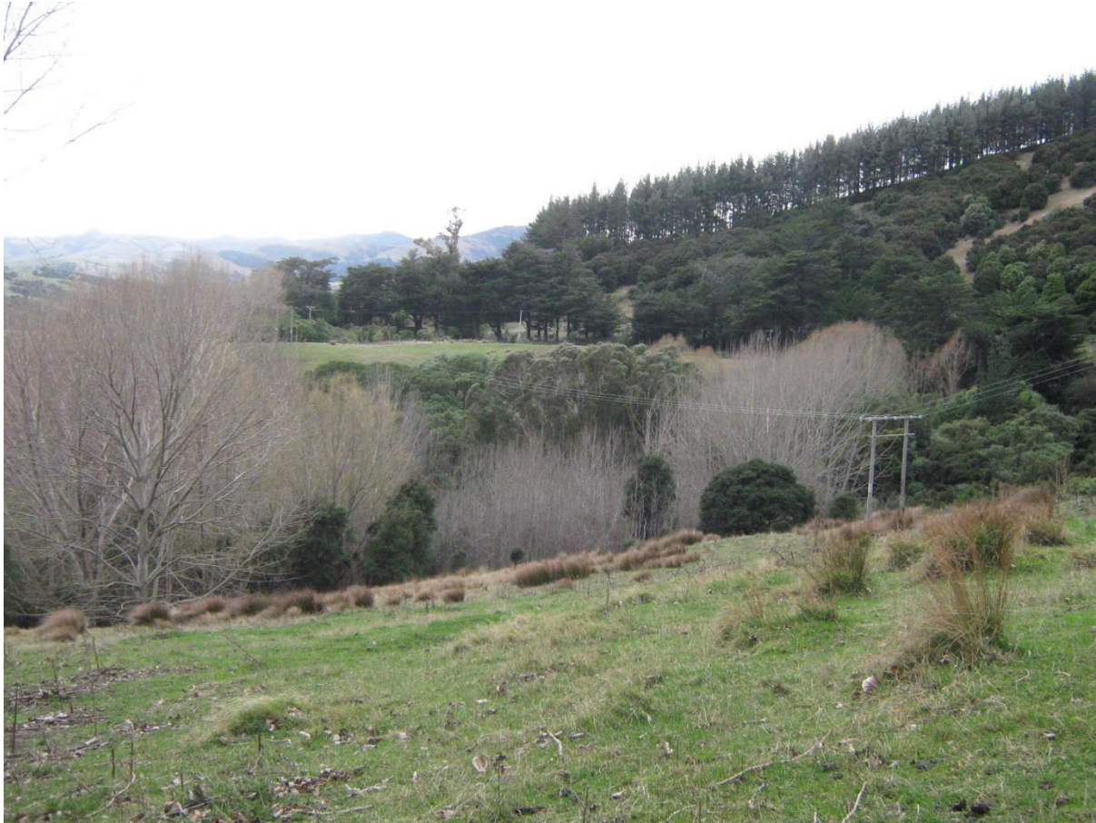
Takapūneke Reserve – Looking from Te Wahi Ao o Takapūneke to the flat capped area of the landfill site, proposed for a car park. Electricity power cables crossing the reserve.