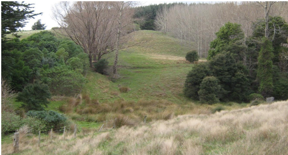
Takapūneke Reserve - Looking from Beach Road across Te Wahi Ao o Takapūneke, between the trees to the capped knoll of the landfill site – proposed area for the central path (refer below to section 5.11 Access and Paths, Policy 2. i.)