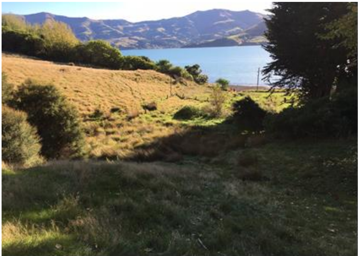
Takapūneke Reserve – Looking from Te Wahi Ao o Takapūneke towards Beach Road and Akaroa harbour.

The cultural, social, heritage, landscape and archaeological values of Takapūneke Reserve are recognised, protected and enhanced through the integrated co-governance of the reserve by Ōnuku Rūnanga and Christchurch City Council for future generations.