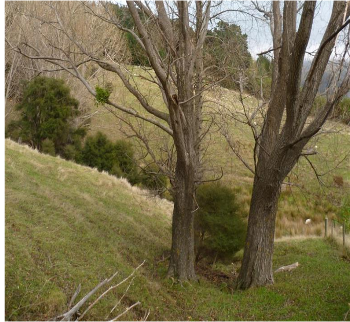
Green mistletoe Ileostylus micranthus on a willow branch at Takapūneke Reserve