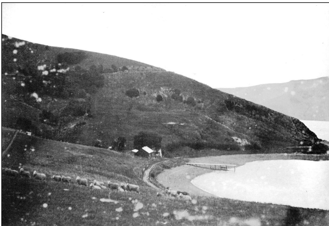
Red House Bay c1900. The barracks is visible in the centre of the photograph.