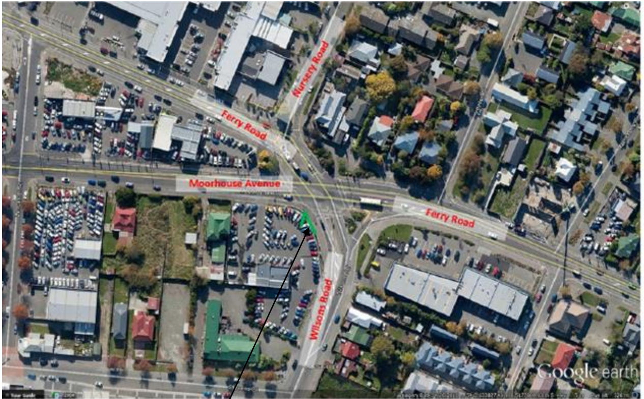
Location of proposed sign annotated in green