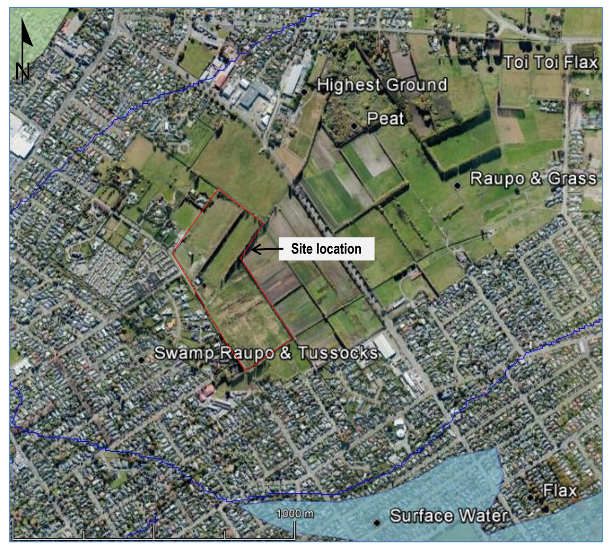
Figure 7: Project Orbit screenshot of the 1856 Environmental Ecology 'Black Map'

The 1856 Environmental Ecology 'Black Map' map shown in Figure 7 identifies 'raupo swamp and tussocks' in the vicinity of the site. This is consistent with bore log information for the area identifying peat and organic-rich sediments, and the presence of drainage features shown on Figure 1.