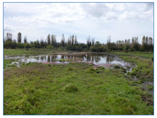
Figure 2: Localised ponding in southern paddocks