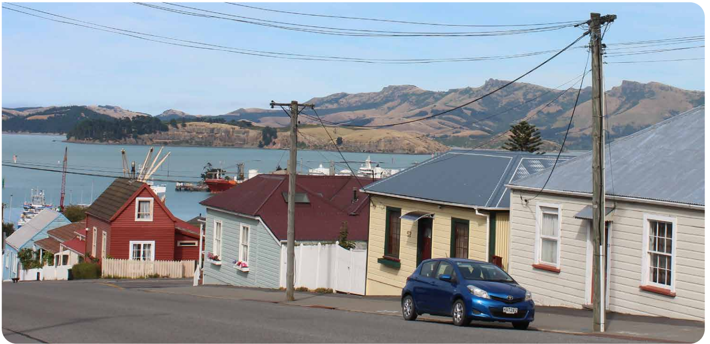
Oxford Street – weatherboard cottages, with symmetry in windows and entry ways, but variety in roof form and colour