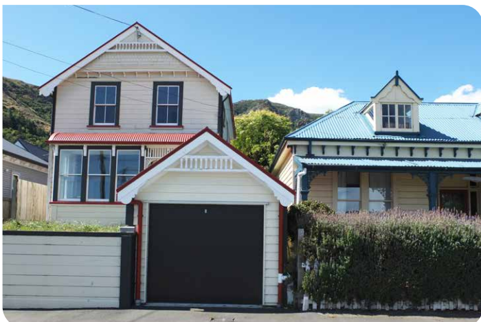
A small scale garage that ties in with the adjacent houses, with visibility maintained between the house and street