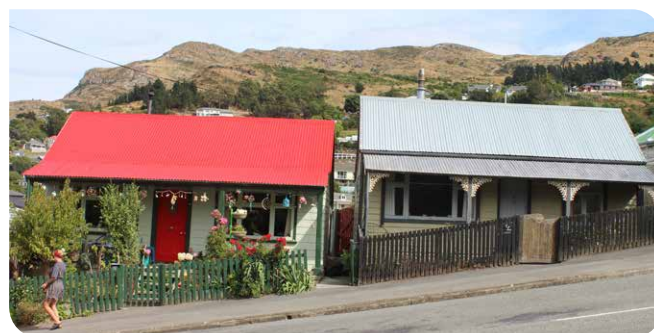
Historic cottages – 45 and 47 Canterbury Street