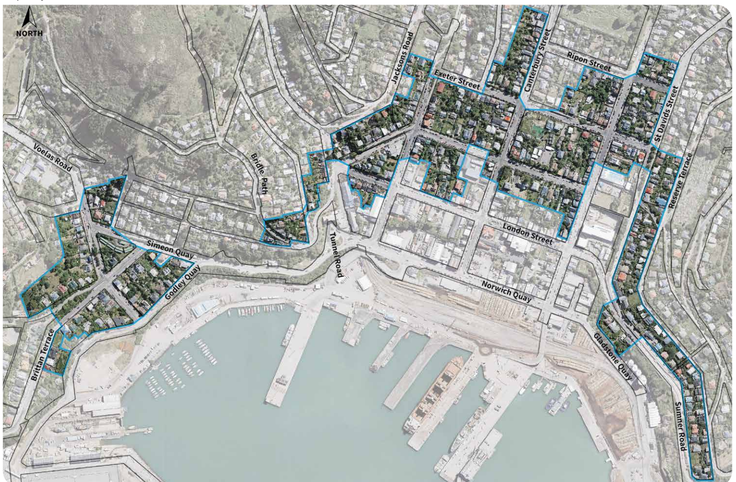
Map of Lyttelton's Character Areas