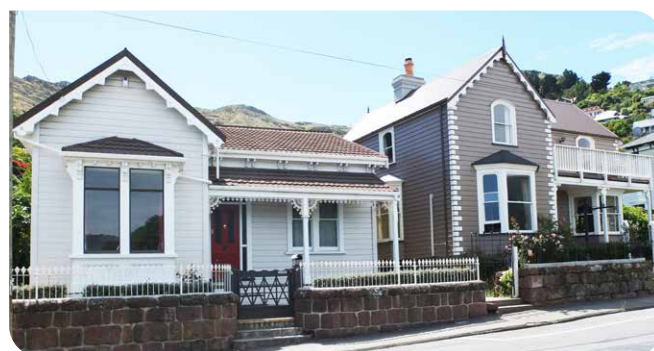
Houses on varying scales but compatible forms and architectural detailing