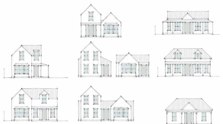
Some of the variations in building and roof form, with symmetry in the location of doors and windows, of the Lyttelton Character Area