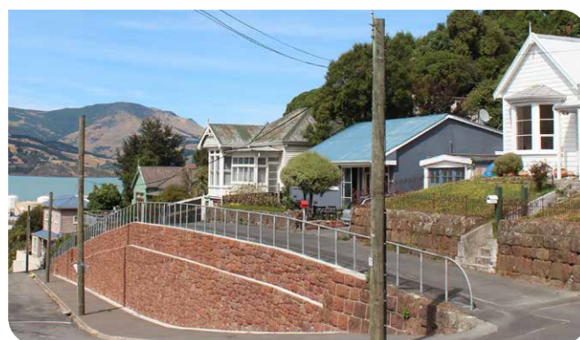
Reconstructed stone retaining walls, early 20th century houses