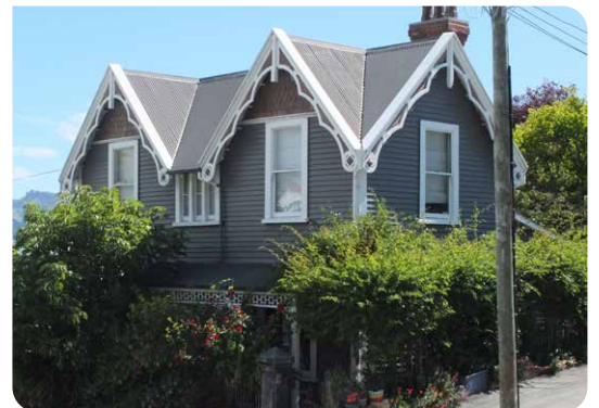
Gable ends and windows oriented to both street fronts.