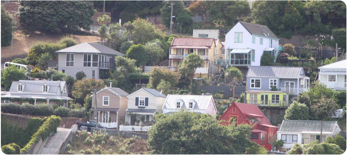
A collection of houses, simple in form, steeper gable roofs, verandas, entry porches, dormer and bay windows.