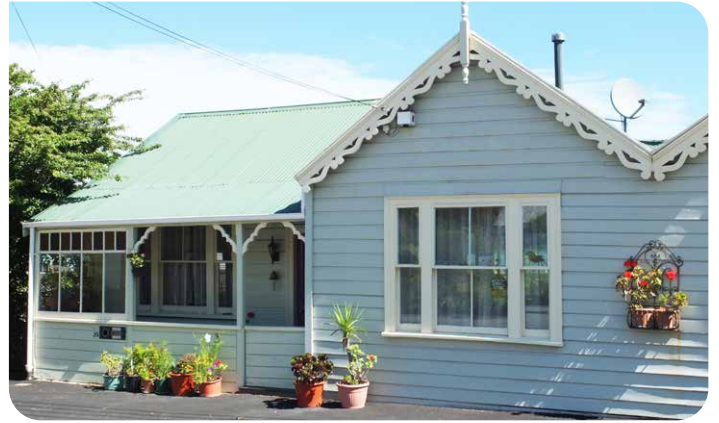
House located at street edge, decorative porch with semi-private space