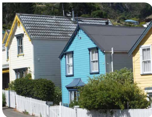
Tightly knit houses built close to the street