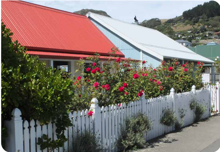
A low hedge, and low fences with planting behind define the street edge, contributing to street amenity