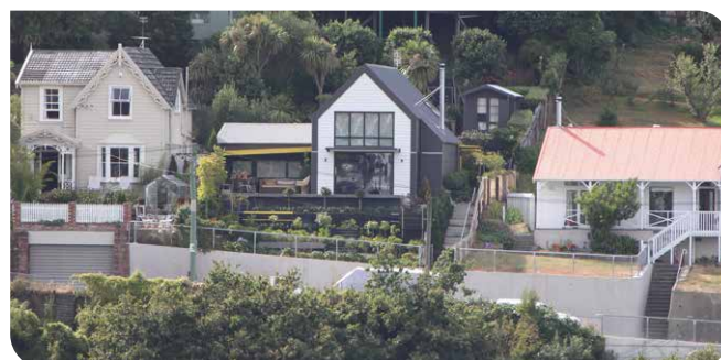
A contemporary house within a character context