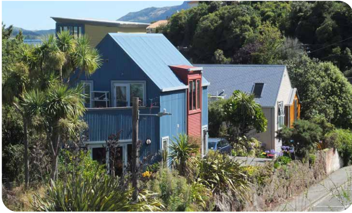
The landscape setting, including tī kōuka, other native planting, and characteristic stone walls