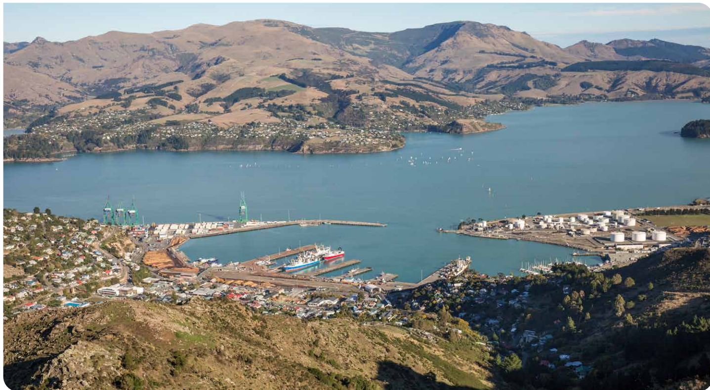
Whakaraupō (Lyttelton Harbour) and Lyttelton township. ChristchurchNZ

This design guide is subject to review and updates pending Council decisions on suburban intensification, expected December 2025.