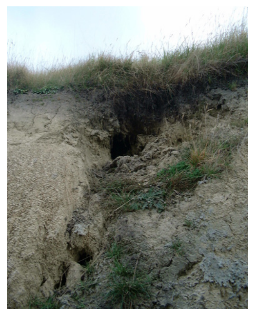
Tunnel gully exposed by earthworks