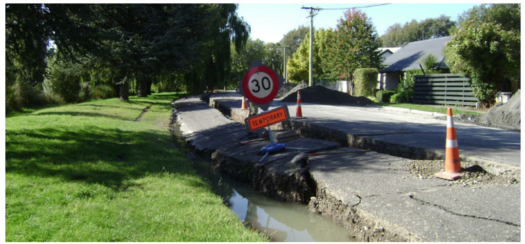
Lateral spread due to liquefaction

The original Technical Categories maps are included under the "Other Maps" tab ("MBIE Technical Categories" layer) at https://apps.canterburymaps.govt.nz/ChristchurchLiquefactionViewer/.