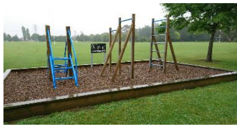
Example of Fitness Station