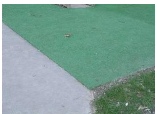
Safety matting playground surface. This playground surface has a flush surface level with no border.