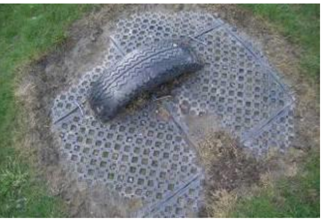
Matta tile playground surface. This playground surface has a flush surface level with no border.