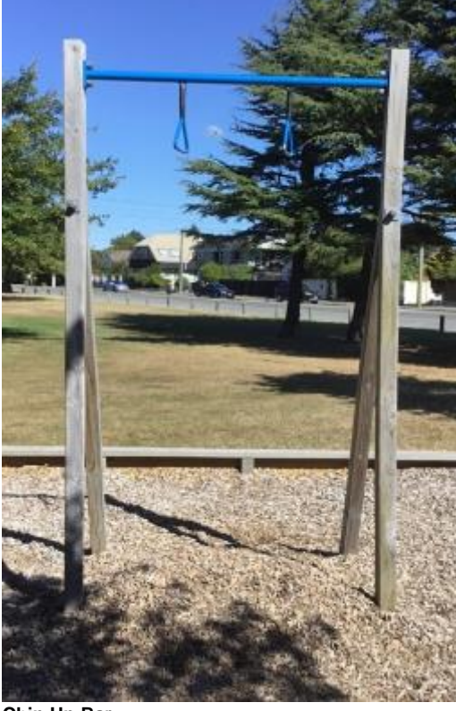
Chin Up Bar