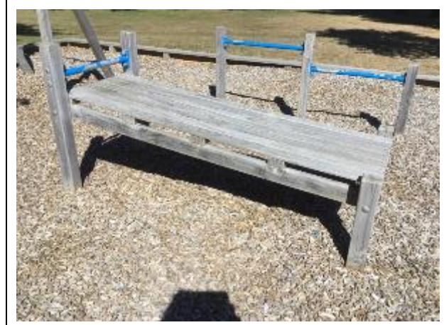
Sit Up Bench