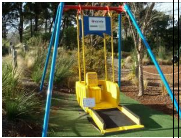
A disabled swing seat.