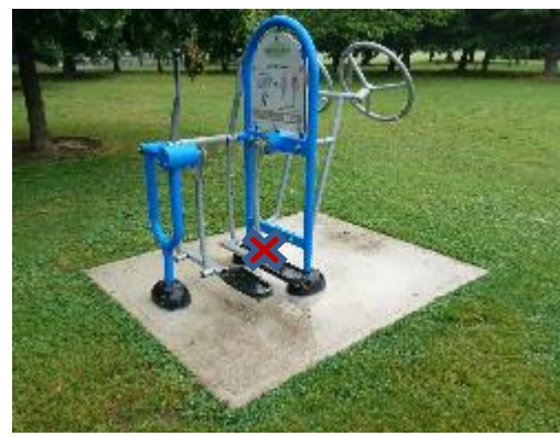
Moving Multi Exercise