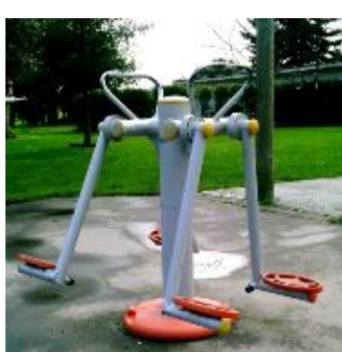
Moving Multi Exercise – Structure that combines more than one exercise and is built with moving parts