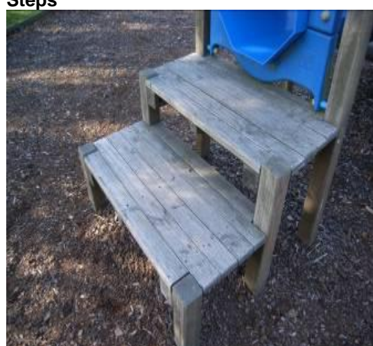
Steps are stairways designed for access to platforms at different elevations. Handrails will often be installed alongside steps.