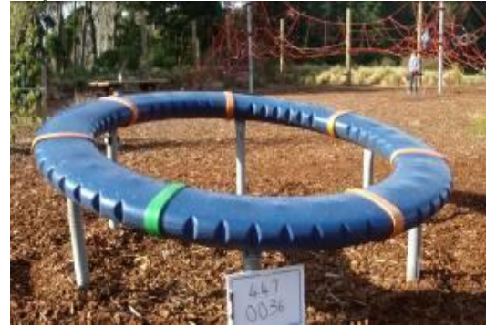
A supa nova is a slightly inclined ring that rotates in a similar fashion to a roundabout.