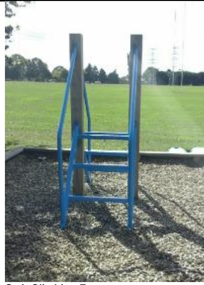
Stair Climbing Frame