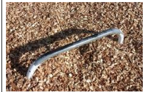
Push Up Bars