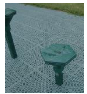
Stepping Stretch – Stand on one step and stretch to next one.