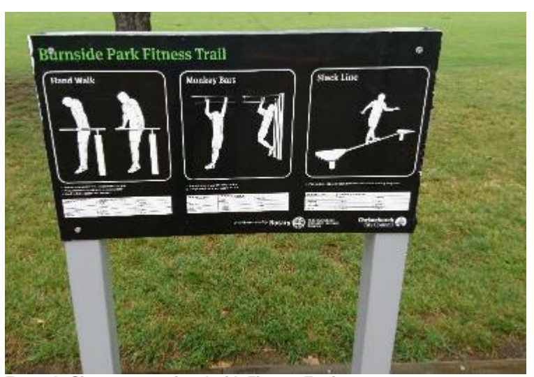
Example Signage associated with Fitness Equipment