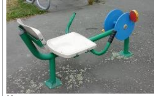
Moving Single Exercise – Structure that is designed for one exercise and is built with moving parts