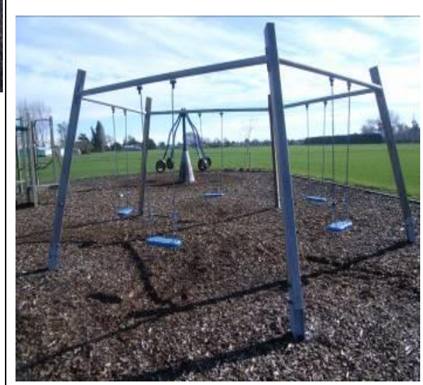
A swing with five standard seats.

Swings allow a person to oscillate back and forth in a pendulum like motion. Typically, a swing is a seat suspended from an overhead beam by chains. More than one seat can be suspended from the same beam. A standard swing seat is a flat board or flexible belt that is sat on. An infant swing seat has holes for legs, a safety belt in the front and a high back. Disabled swing seats are platforms capable of wheelchair access. When recording swings the total number of swing seats, number of standard swing seats, number of infant swing seats and the number of disabled swing seats must be recorded.