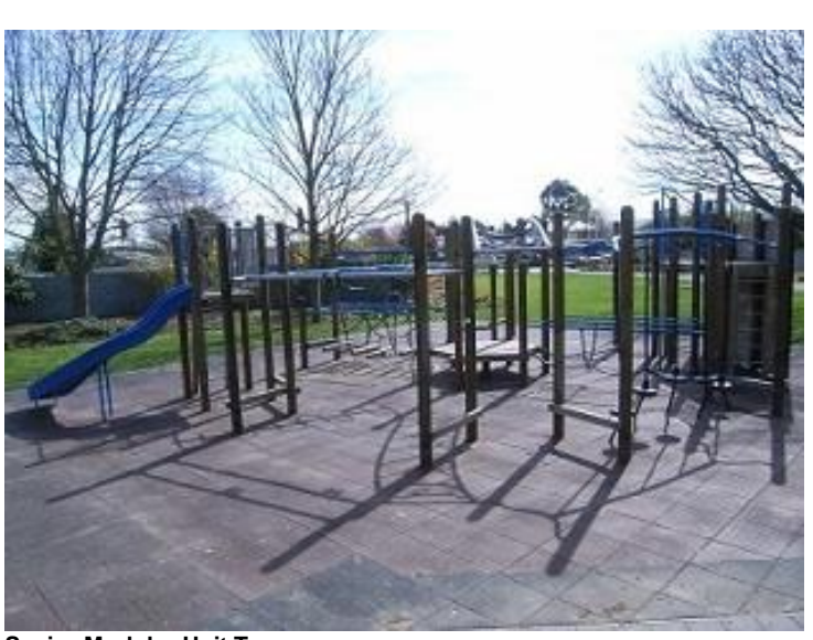
Senior Modular Unit Type