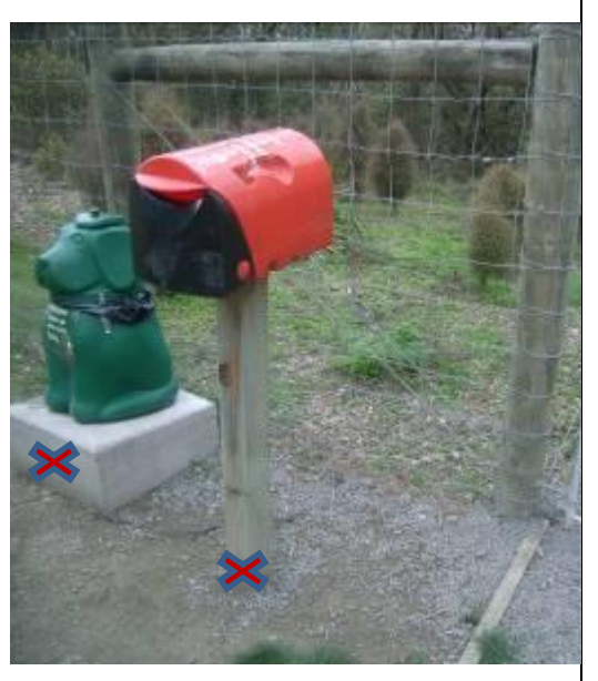
A Bag Dispenser(red) alongside a Canine Waste bin(green).