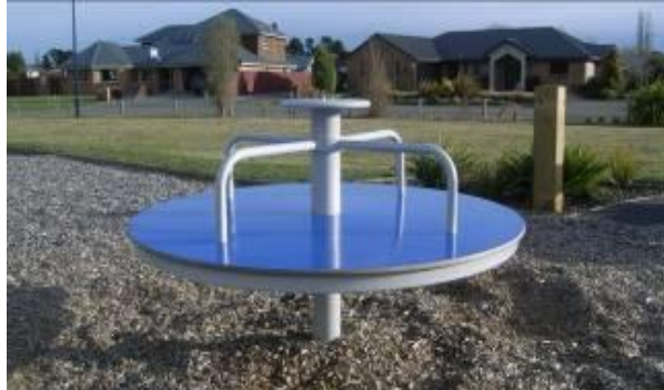
A roundabout is a circular structure that rotates around a central pivot. Most roundabouts are a solid disc with handrails.