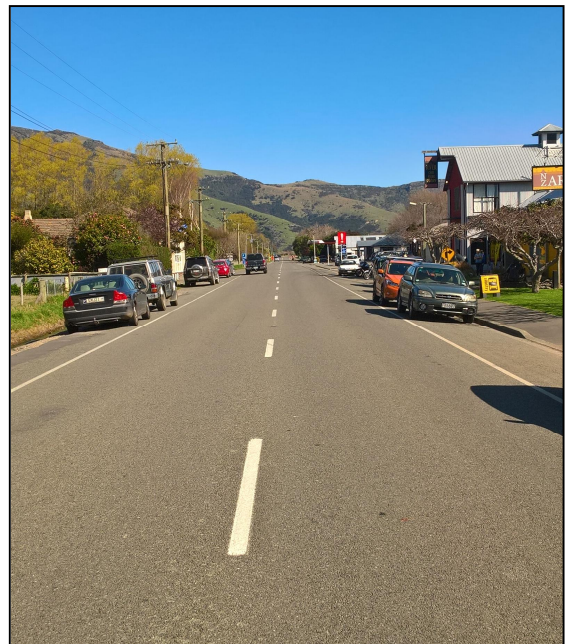
Christchurch-Akaroa Road SH75. Proposed 60km/h

The speed limits on adjoining Council controlled side road are also proposed to reduce to match the proposed changes on SH75. In addition it is proposed to extend the existing 50km/h speed limit on Western Valley Road to the Church Road intersection.