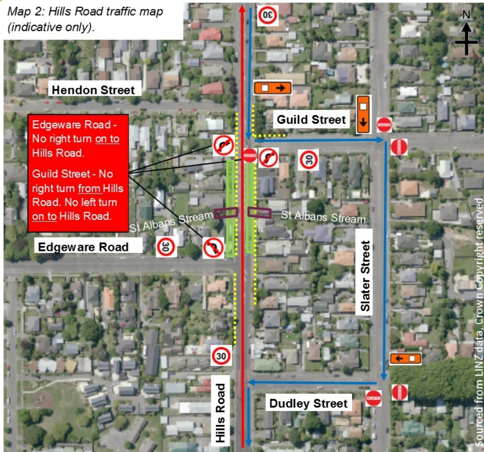
Map 2: Hills Road traffic map (indicative only).