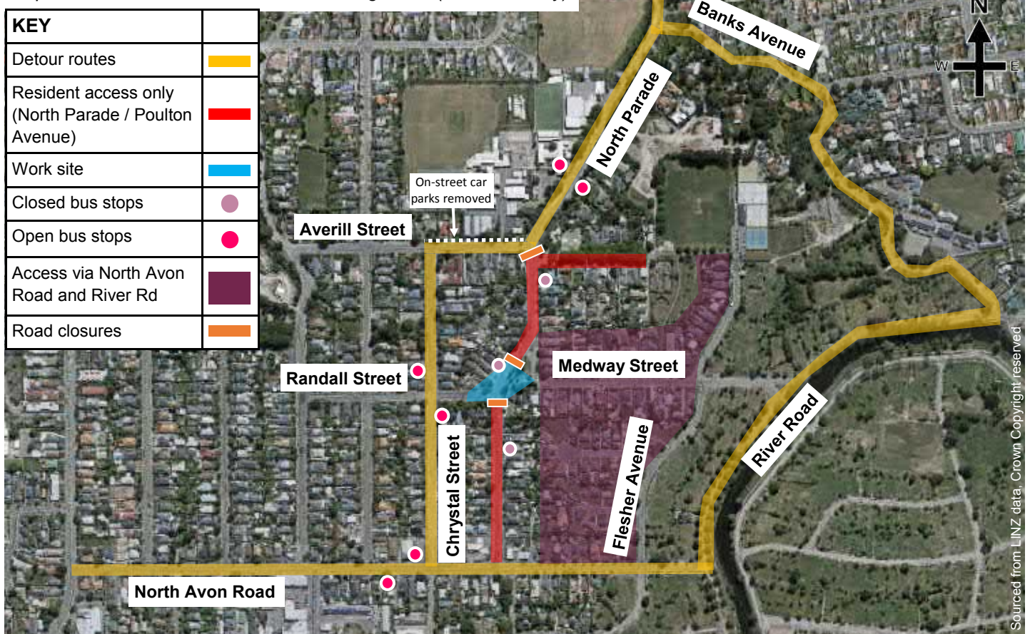
Map 2. North Parade Closure Traffic Management (indicative only)