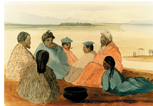
Port Cooper Natives, 1849 by William Fox

The peace negotiated by Ngati Mamoe and Ngāi Tahu lasted barely 50 years. A major feud developed on Banks Peninsula that eventually sapped the fighting strength and social cohesion of Ngāi Tahu. Known as the Kai Huanga feud, escalating insult and retaliation from 1824 to 1830 led to massacres of closely related people. For the first time the warriors used muskets, which had been obtained from early European sealers and flax traders.