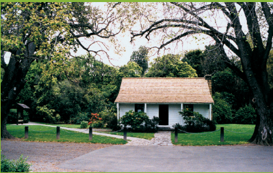
Deans Cottage, Riccarton Bush

Allow 30 minutes to 1 hour to explore this historic site.