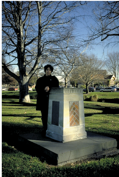
The Bricks Memorial

Within a generation of the arrival of the Canterbury Association settlers, raupo and flax, whare and tent fly gave way to gridded streets and ambitious stone buildings. Like their Māori predecessors, the European settlers named places after ancestors and their original homes, imprinting the new city with their European culture.