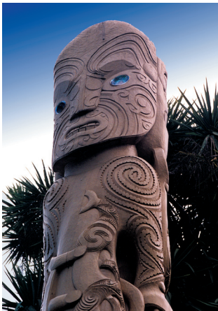
Pou, Victoria Square

For further information, publications and brochures on heritage sites and walks in Christchurch contact Christchurch City Council.