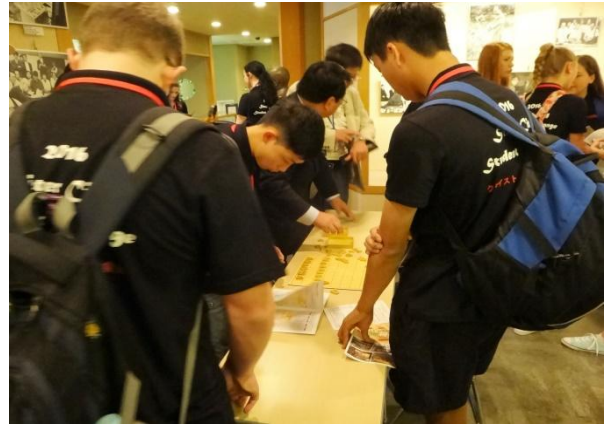
Some students showing interest in Shogi