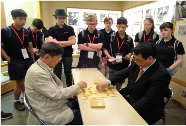
Shogi (Japanese chess) experts playing

Cultural learning day, City sightseeing, Kurashiki City Hall official visit