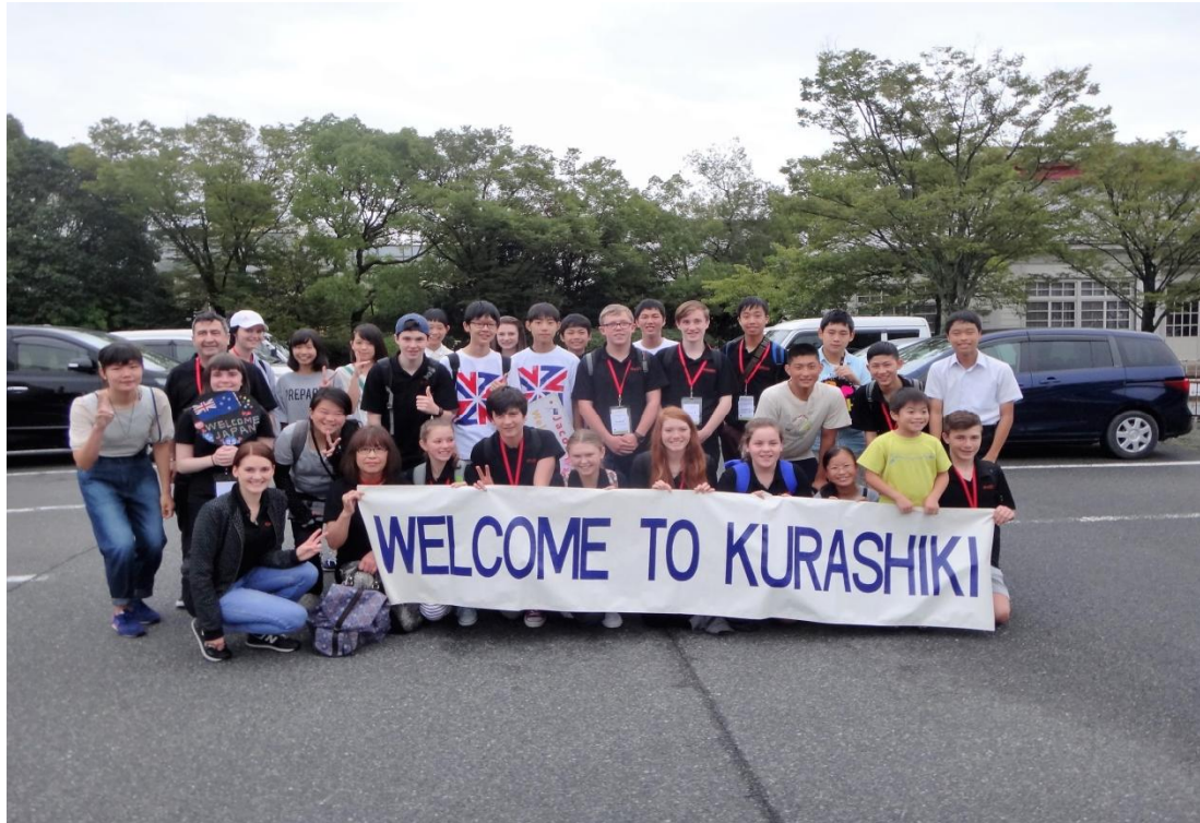
Finally reached Kurashiki after 29 hours from Christchurch