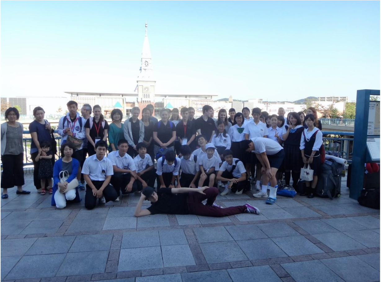
Last farewell at JR Kurashiki Station