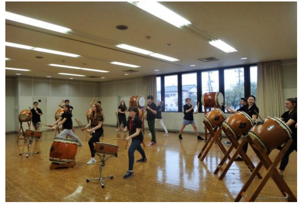
Taiko (Japanese drums) session