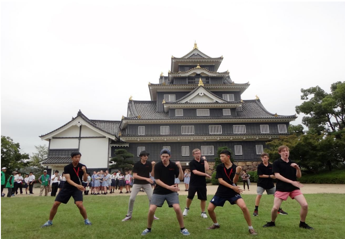
Haka performance with Aussie students looking on at Okayama Castle !! Huge success !!!