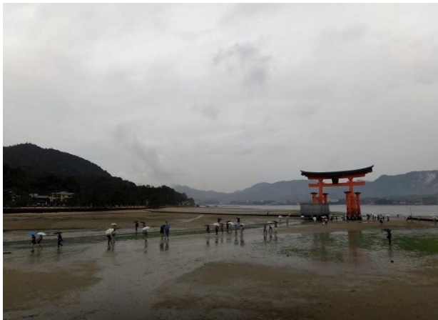
Itsukushima Shrine (Miyajima)