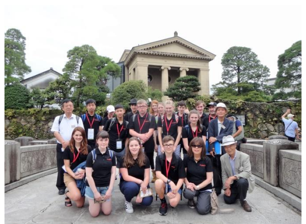
Bikanchiku (Ohara Art Gallery at the back)