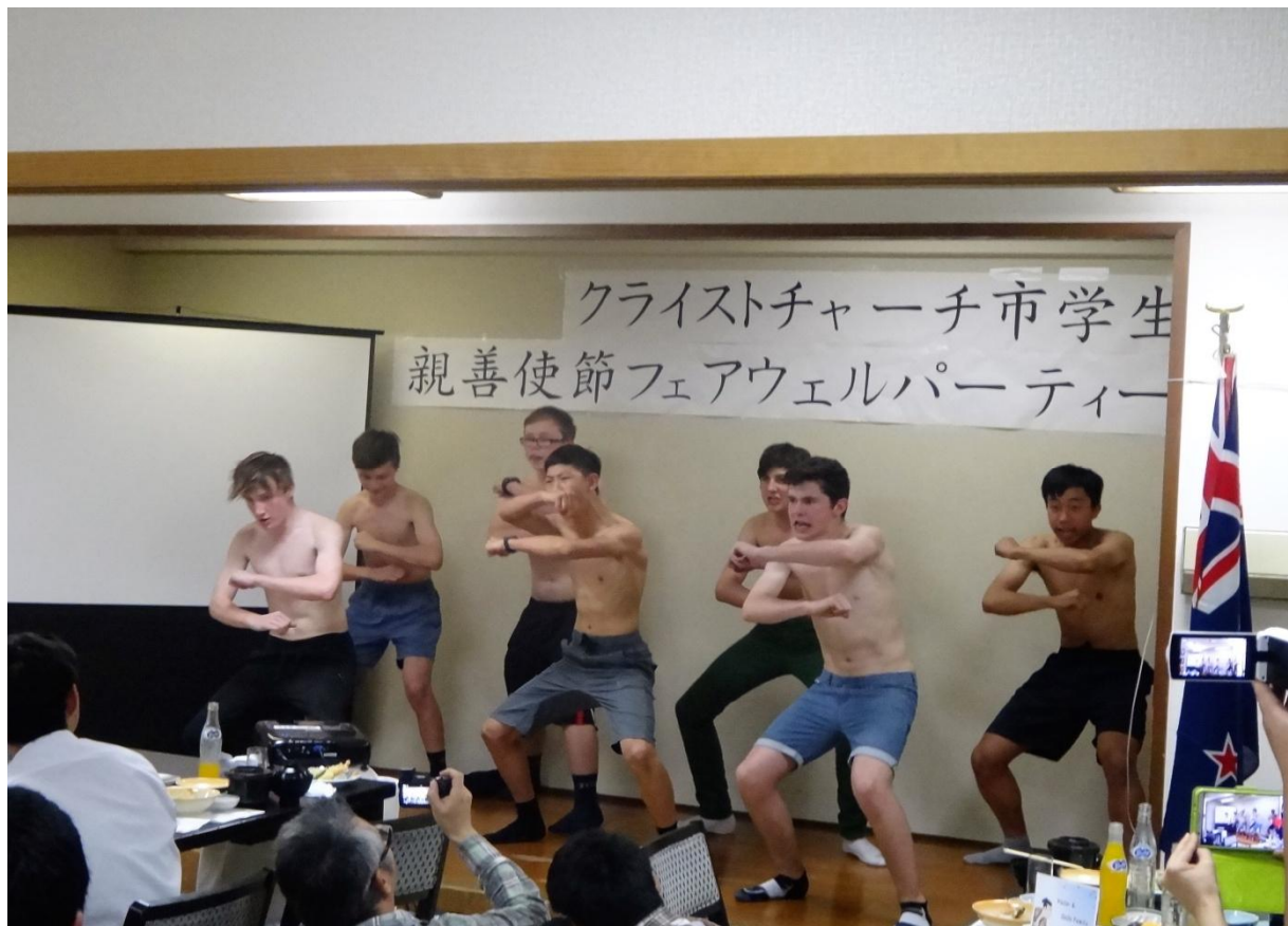
Boys performed Haka their heart-out to our hosts in Kurashiki ! The best one !!