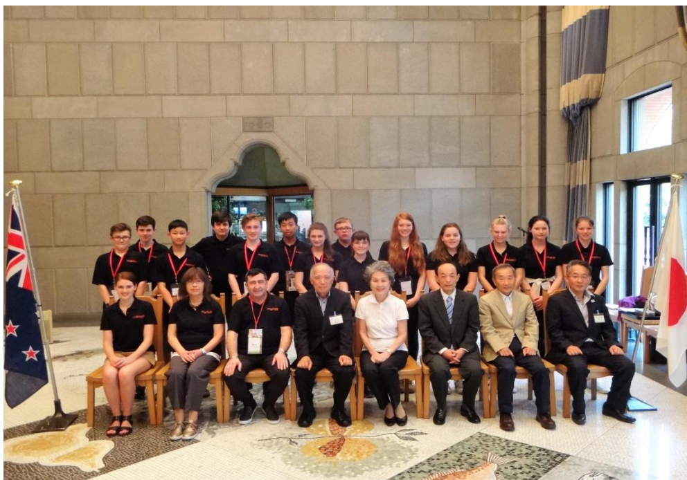
Kurashiki City Hall official visit