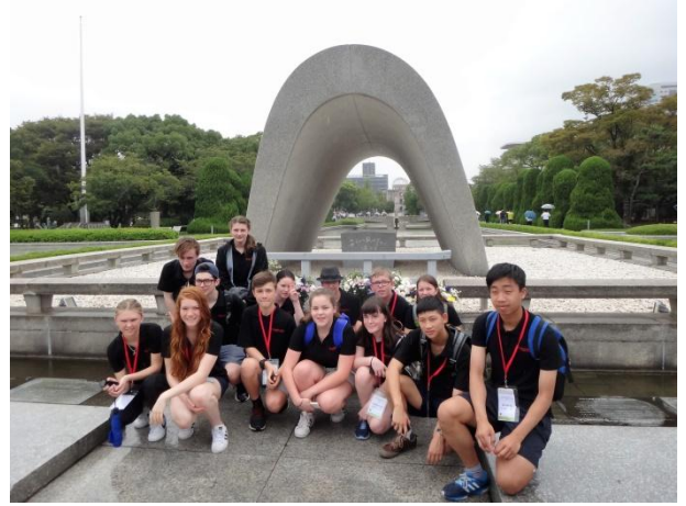
Hiroshima Peace Park