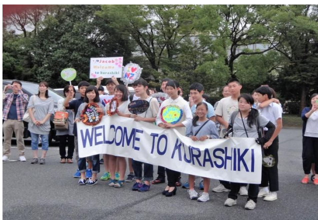
Kurashiki students welcoming us