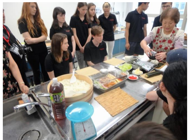
Sushi making session