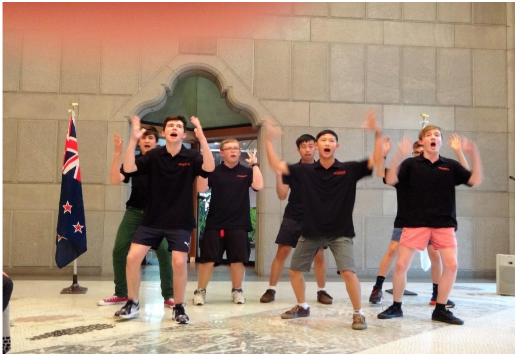
Haka performance (Kamate Kamate)