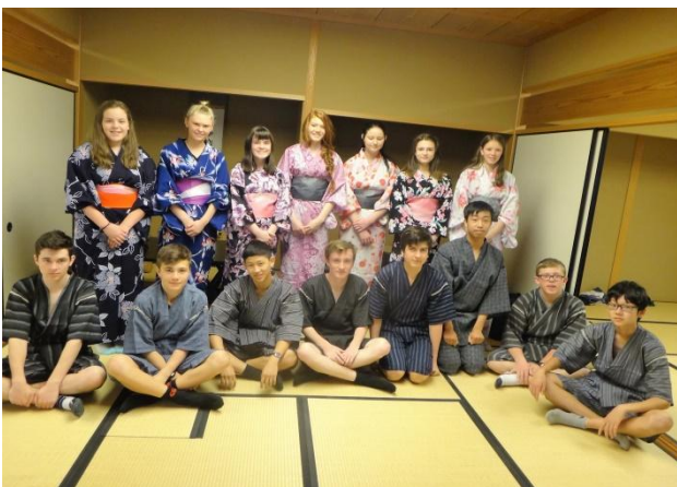
Kimono trying-on session

Japanese Cultural Learning and experience 1