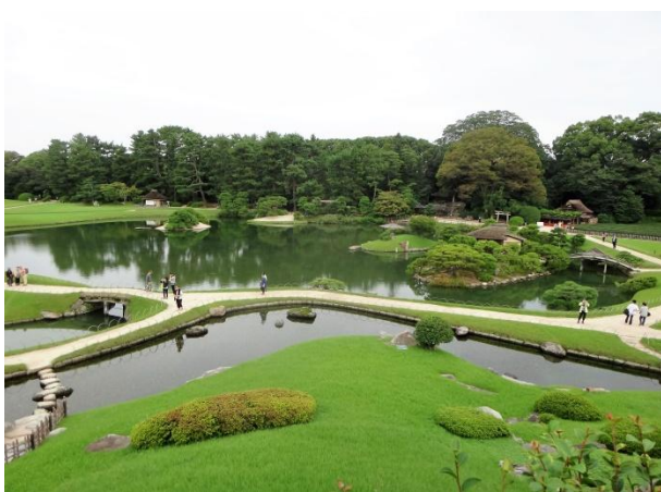
Korakuen Park (Okayama)

Okayama area sightseeing Korakuen Park, Okayama Castle, Kibi historical road