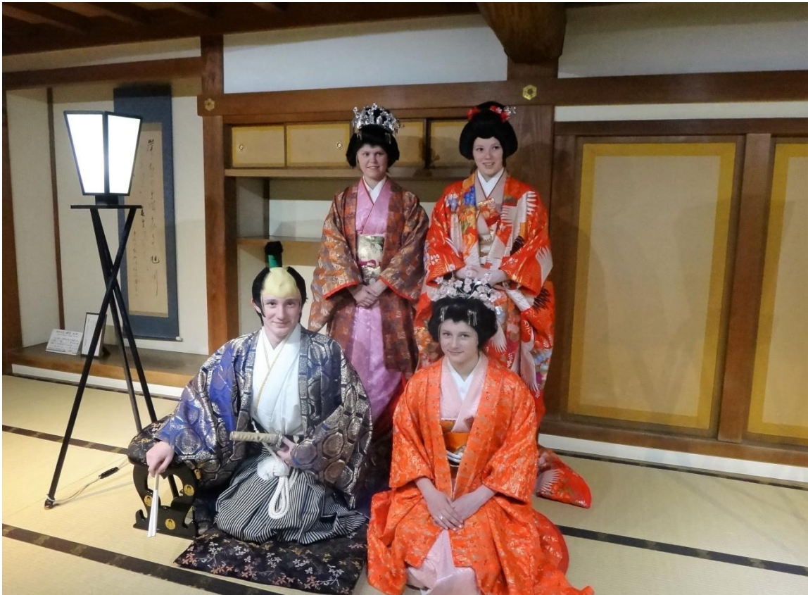
Trying-on historic courtiers' Kimono at Okayama Castle