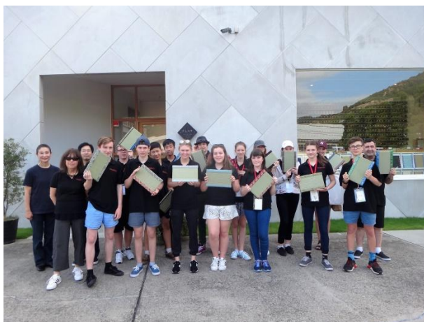
Tatami tape factory