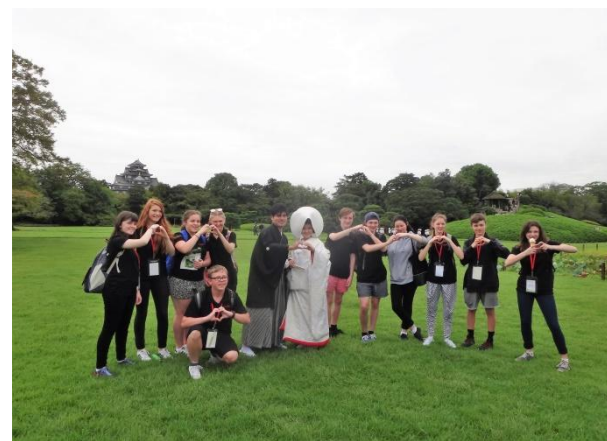
Wedding at Korakuen Park