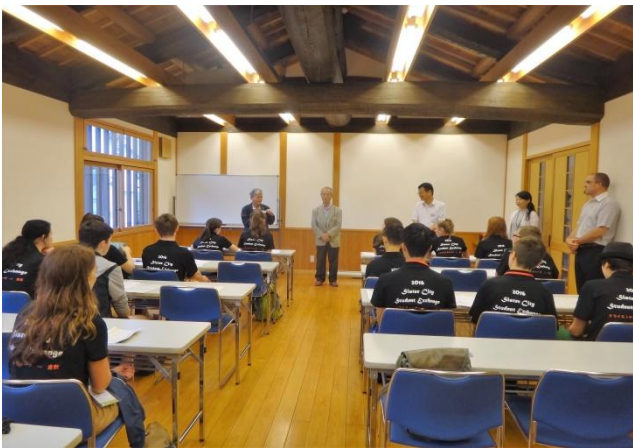
Japanese language study