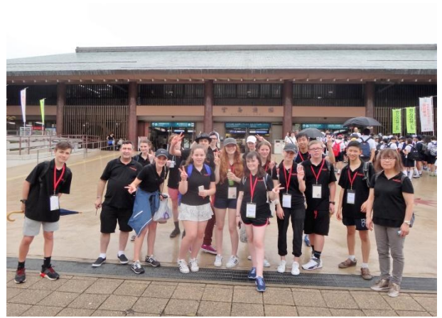
Miyajima Ferry square