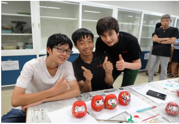
Daruma painting-in session