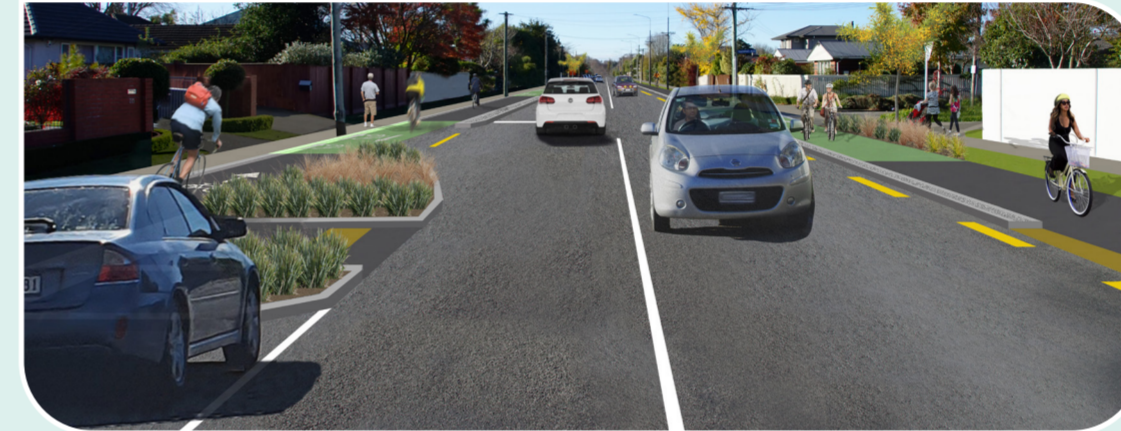
Proposed one-way cycleway (Option A) on Ilam Road, near Hamilton Avenue

We want to know which of these options you prefer. Go online to tell us what you think or use the contact details on reverse