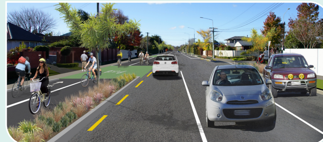
Proposed two-way cycleway (Option B) on Ilam Road, near Hamilton Avenue

We know from speaking with educators that a safe crossing near Ryeland Avenue is important as many parents walk between the nearby primary schools and the kindergarten on Ryeland Avenue.